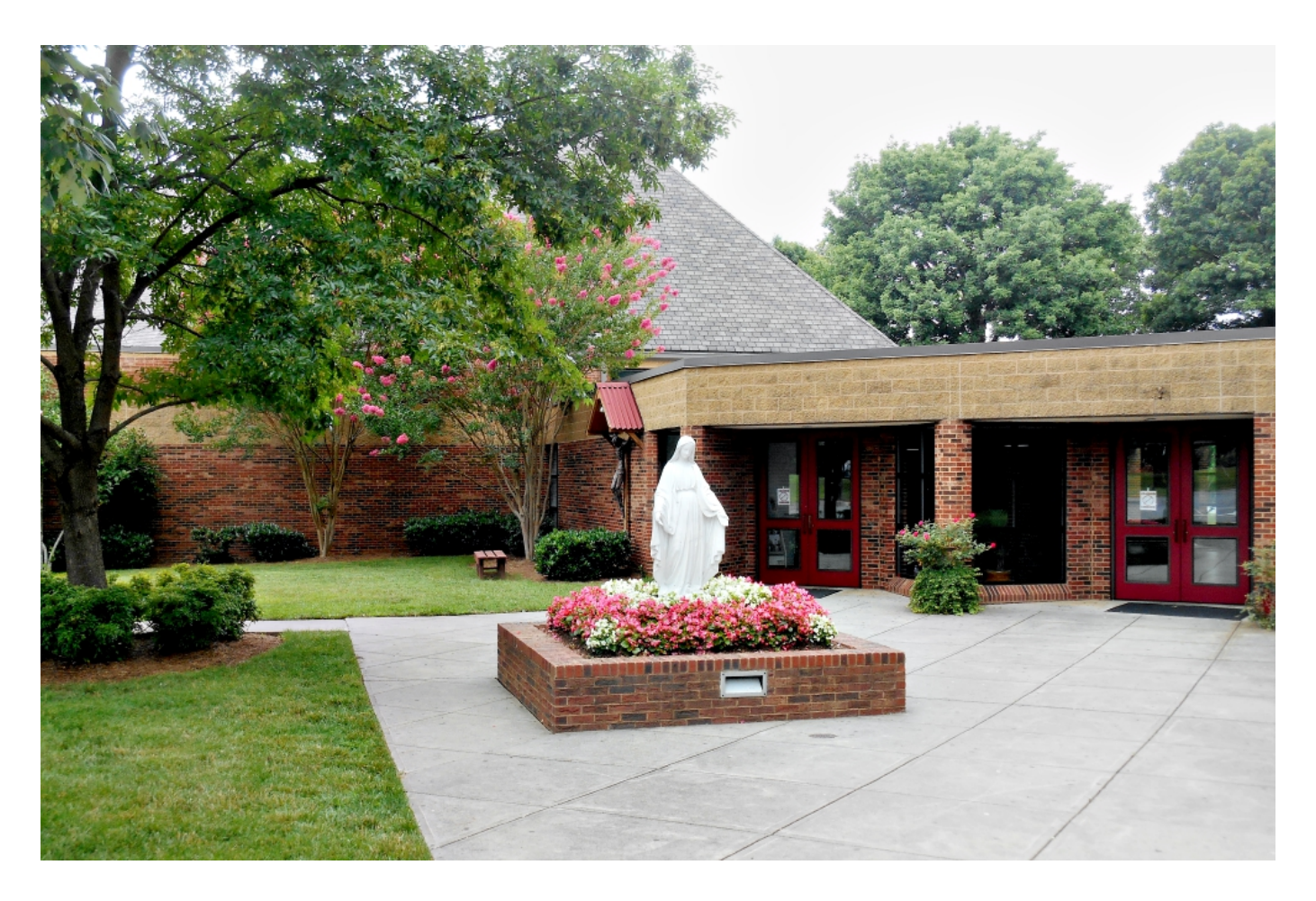
Our Lady of the Assumption Church in Charlotte, North Carolina