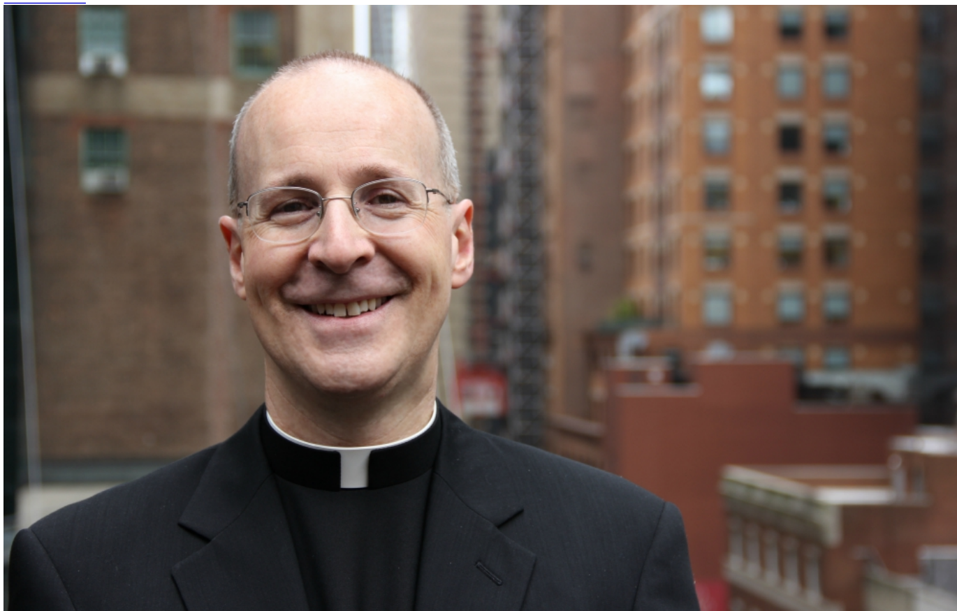
Jesuit Fr. James Martin