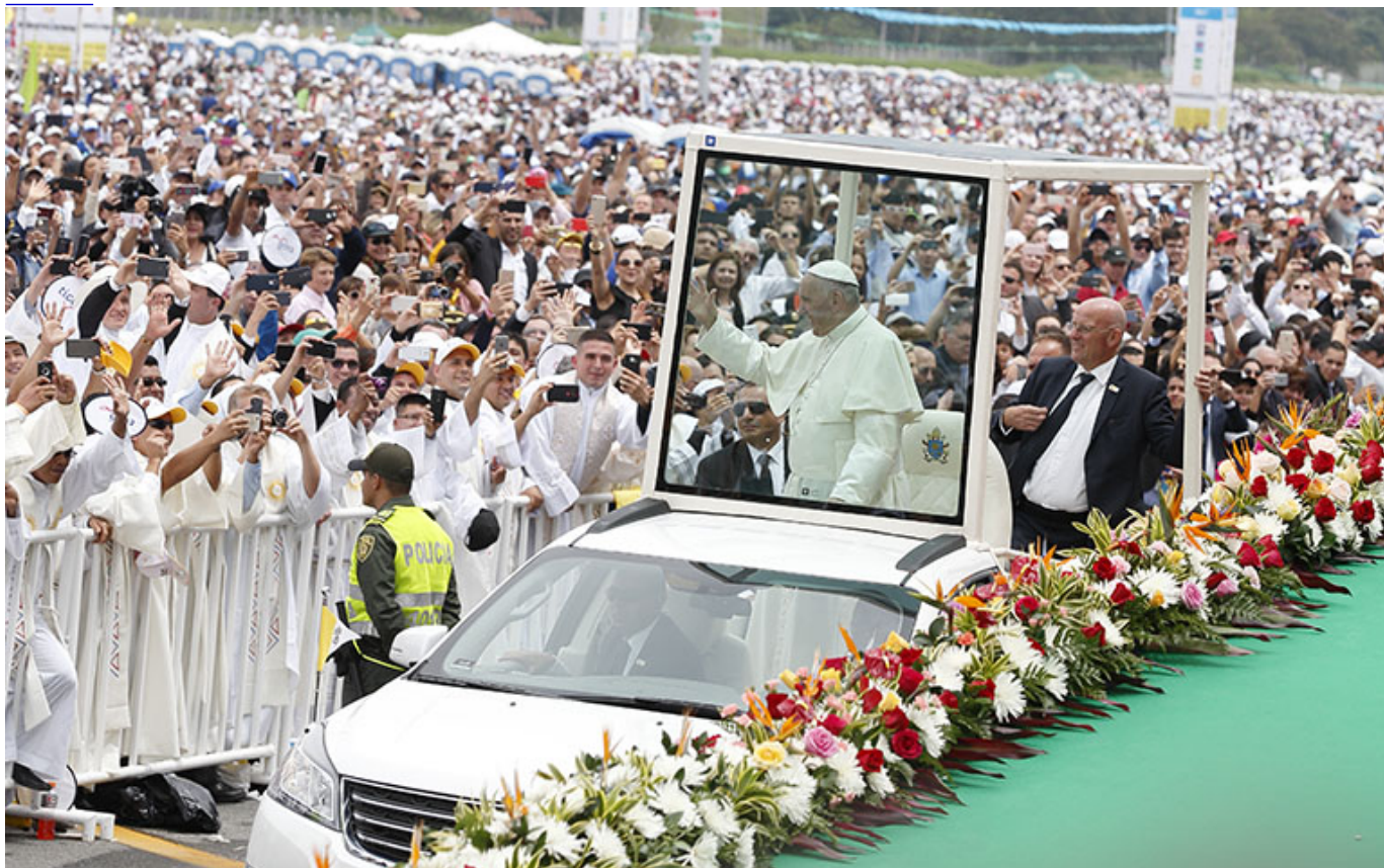
Pope Francis greets the crowd as he arrives to celebrate Mass at Enrique Olaya Herrera Airport in Medellin, Colombia, Sept. 9.