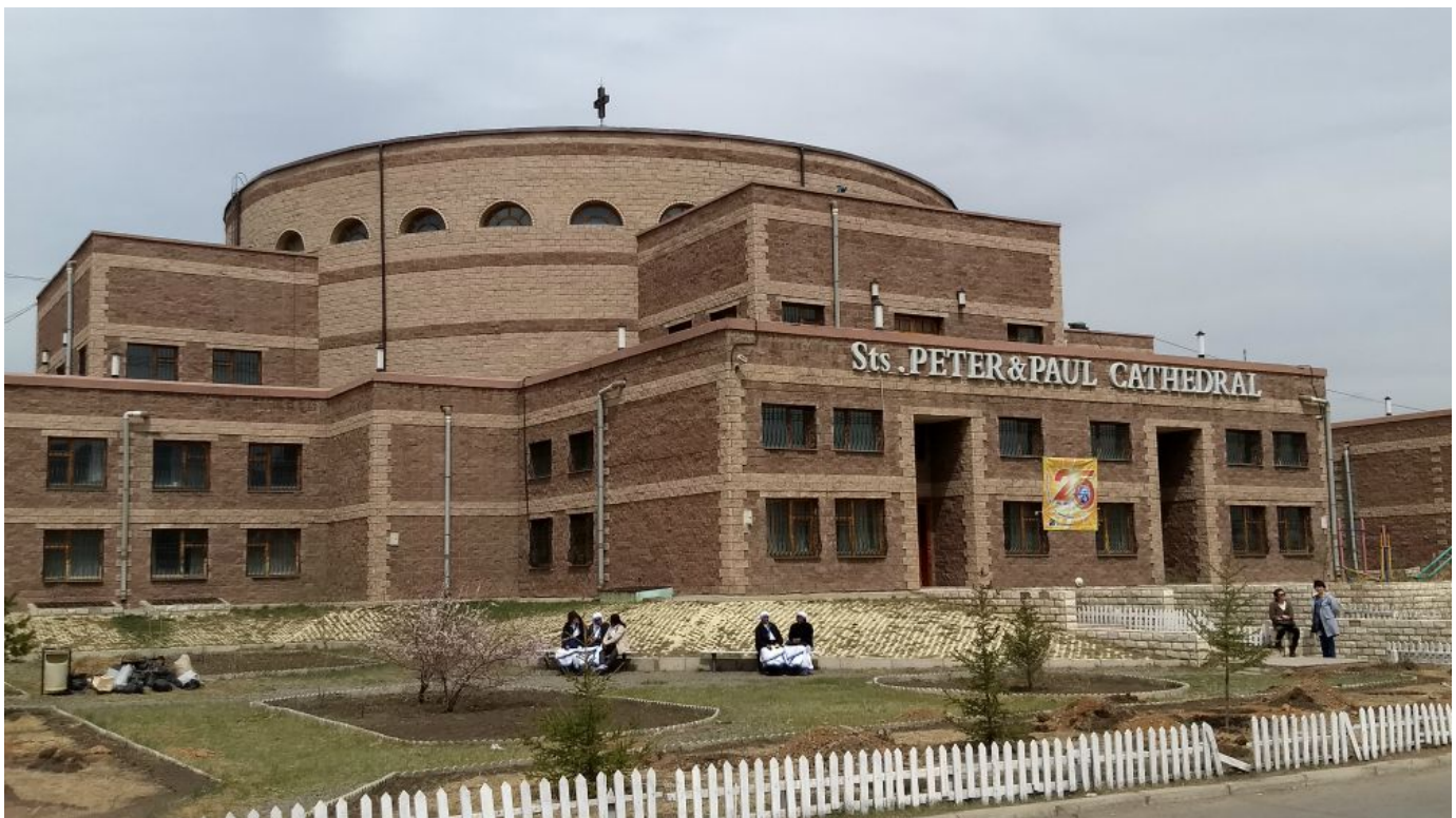
The Cathedral of Sts. Peter and Paul was built in 2003 and is modeled after the traditional nomadic tent used in Mongolia.

As the Federation of Asian Bishops' Conferences have often taught, mission in Asia begins with being with the people, responding to their needs, and witnessing to the values of the reign of God here on Earth. This before-death salvation brought about by the disciples of Christ serves as foretaste and sign of God's kingdom that is to come in heaven. It may be years before a local community emerges and a church established.