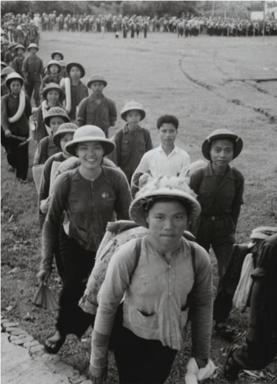
Young North Vietnamese join the Youth Shock Brigades Against the Americans for National Salvation.