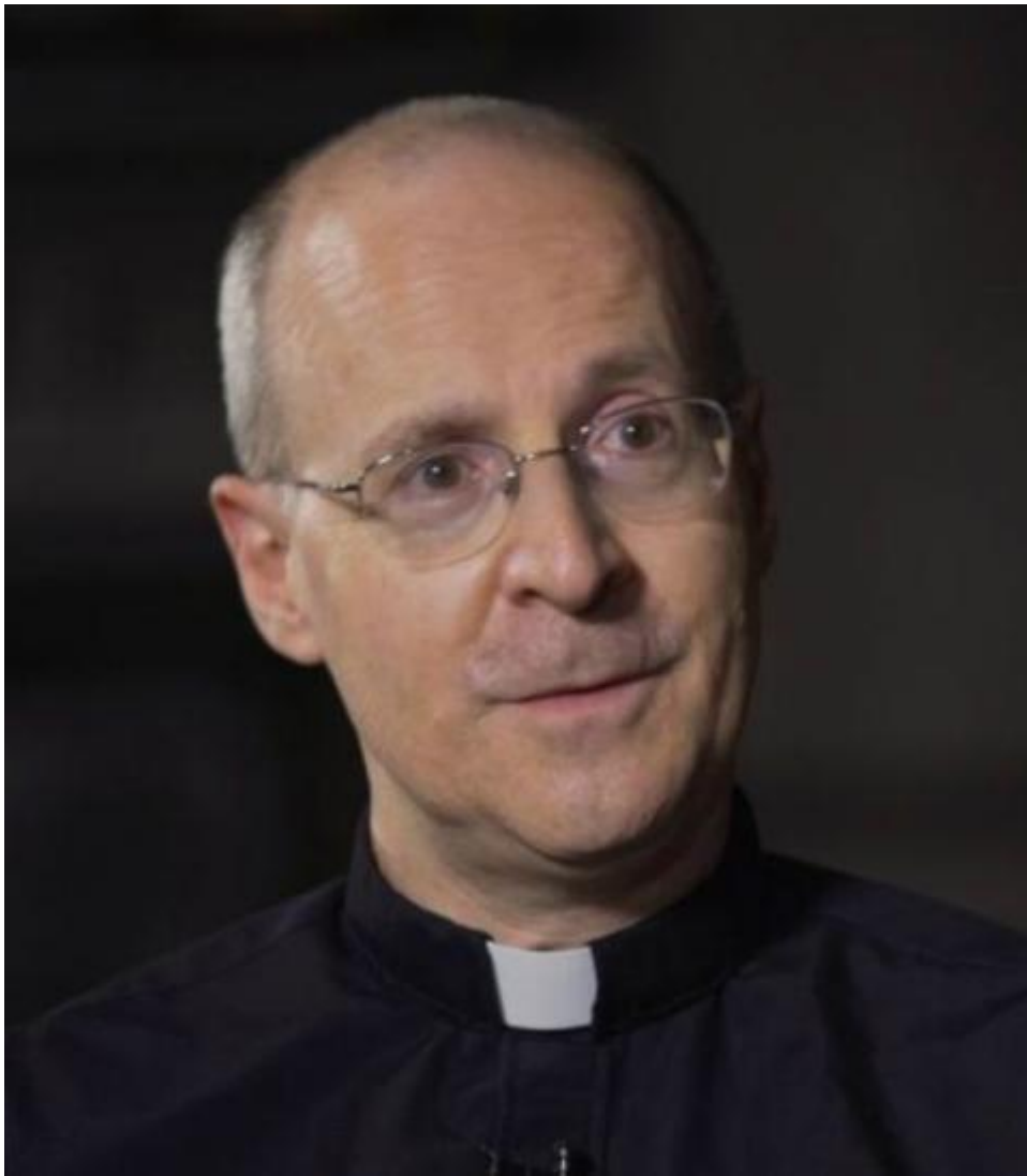
Jesuit Fr. James Martin

The seminary, part of the Catholic University of America, which was founded by the U.S. bishops in 1887 and carries a papal charter, said in a statement sent to alumni Sept. 15 it made the decision in an attempt to avoid distraction and controversy during the centennial anniversary, after it "experienced increasing negative feedback from various social media sites."