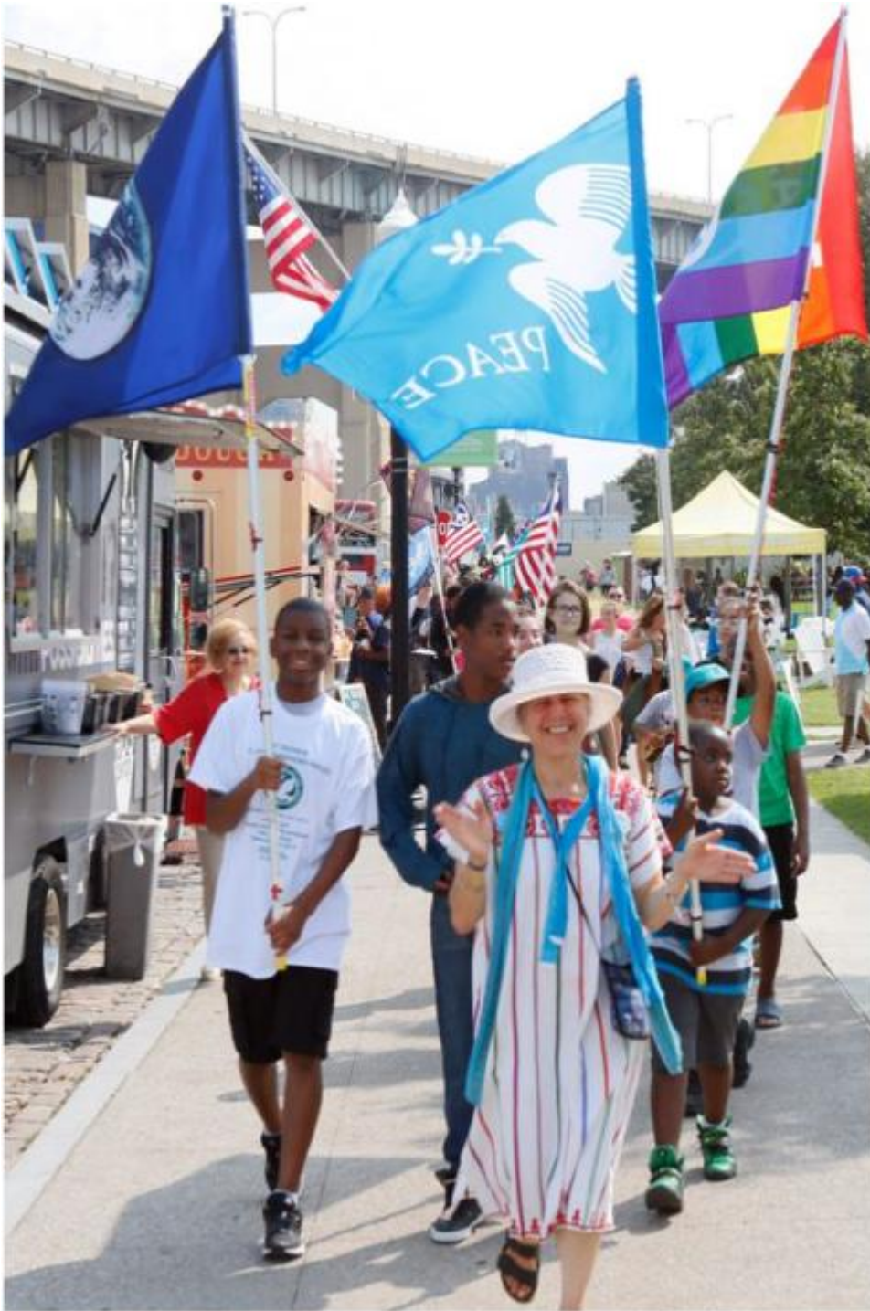
Campaign Nonviolence in Buffalo, New York, 2017

LONDON, ENGLAND — Faith-based groups, including Catholic peace group Pax Christi, the Anglican Peace Fellowship, nearly 200 British Quakers and Wake Up London, a Thich Nhat Hanh-inspired mindfulness group, joined thousands in protesting the world's largest arms fair, the Defense and Security Equipment