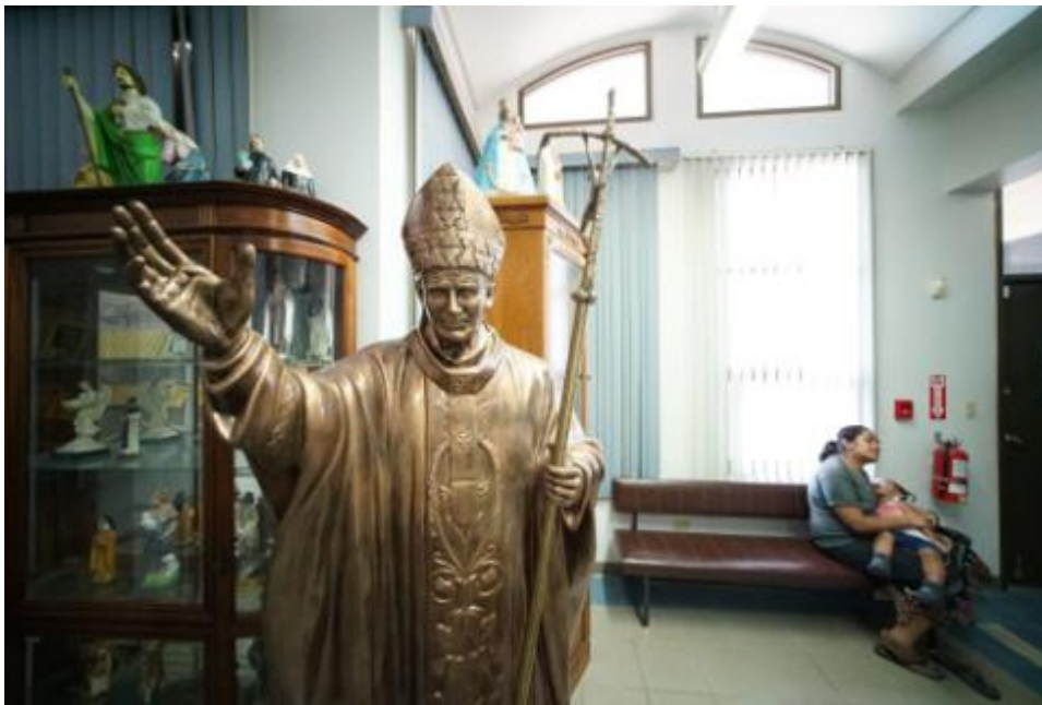
A woman waits with a child behind a statue in the Santa Barbara Catholic Church office in Dededo.