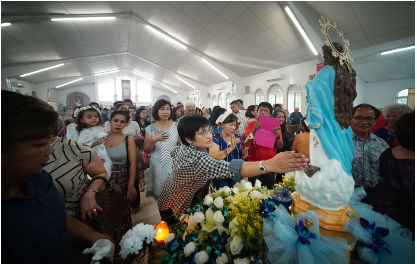
Parishioners pay their respects during a Mass held in honor of the Assumption of Our Lady in Piti, Guam.