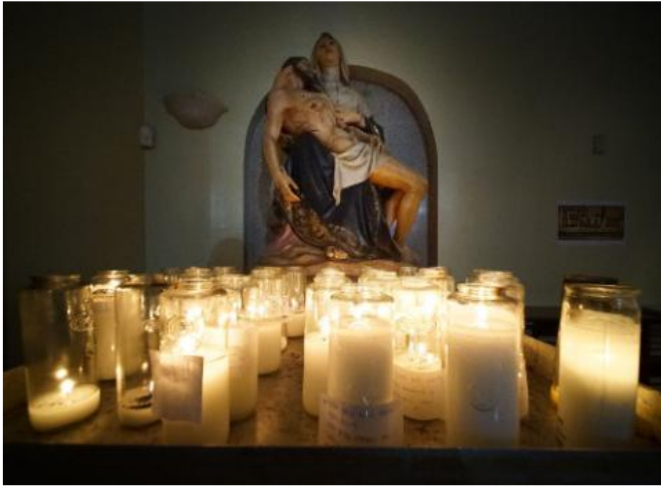
Candles flicker in the Dulce Nombre de Maria Cathedral Basilica in Hagatña, Guam.

For some on Guam, the turmoil calls into question what it means to be Chamorro on an island where religion is for many inseparable from indigenous culture.