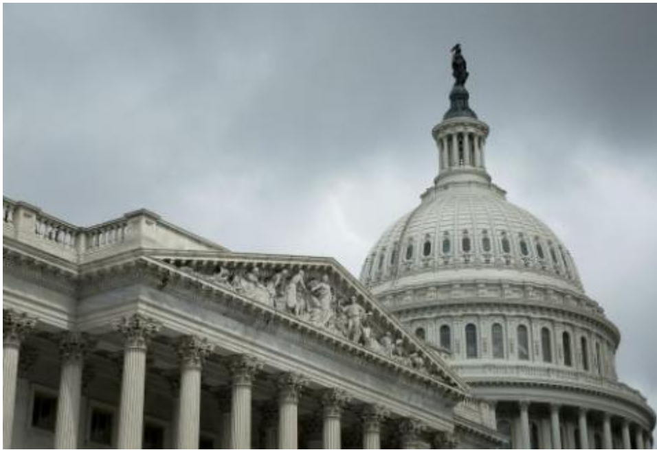
The U.S. Capitol in Washington

The extent of the alliance between Buchanan's mind and Koch's money takes several chapters to tell. I do not want to give the whole story away — I want you to buy the book, read it, and share it with a friend. But if you think this is just all so much interesting, albeit scary, history, think again. Think of the crisis in Flint, Michigan, a direct outgrowth of the Koch-funded Mackinac Center, which first began the push for state-appointed city managers with no accountability to the electorate. Think of the disinformation campaign about climate change and its success: "The number of Americans who believed that 'continued burning of fossil fuels would alter the climate' dropped from 71 percent in 2007 to 44 percent in 2011." Think of the efforts to suppress voter participation that have created a fake issue — voter fraud — to justify restrictions on the franchise that disproportionately harm the poor. Through the American Legislative Exchange Council and the State Policy Network, both funded by Koch, the radical vision of a polity organized not around shared rights of citizenry but around property rights made sacrosanct is being implemented from Wisconsin to North Carolina. And their special focus on races for judgeships may be the least noticed, but most consequential, direct involvement in electoral politics.