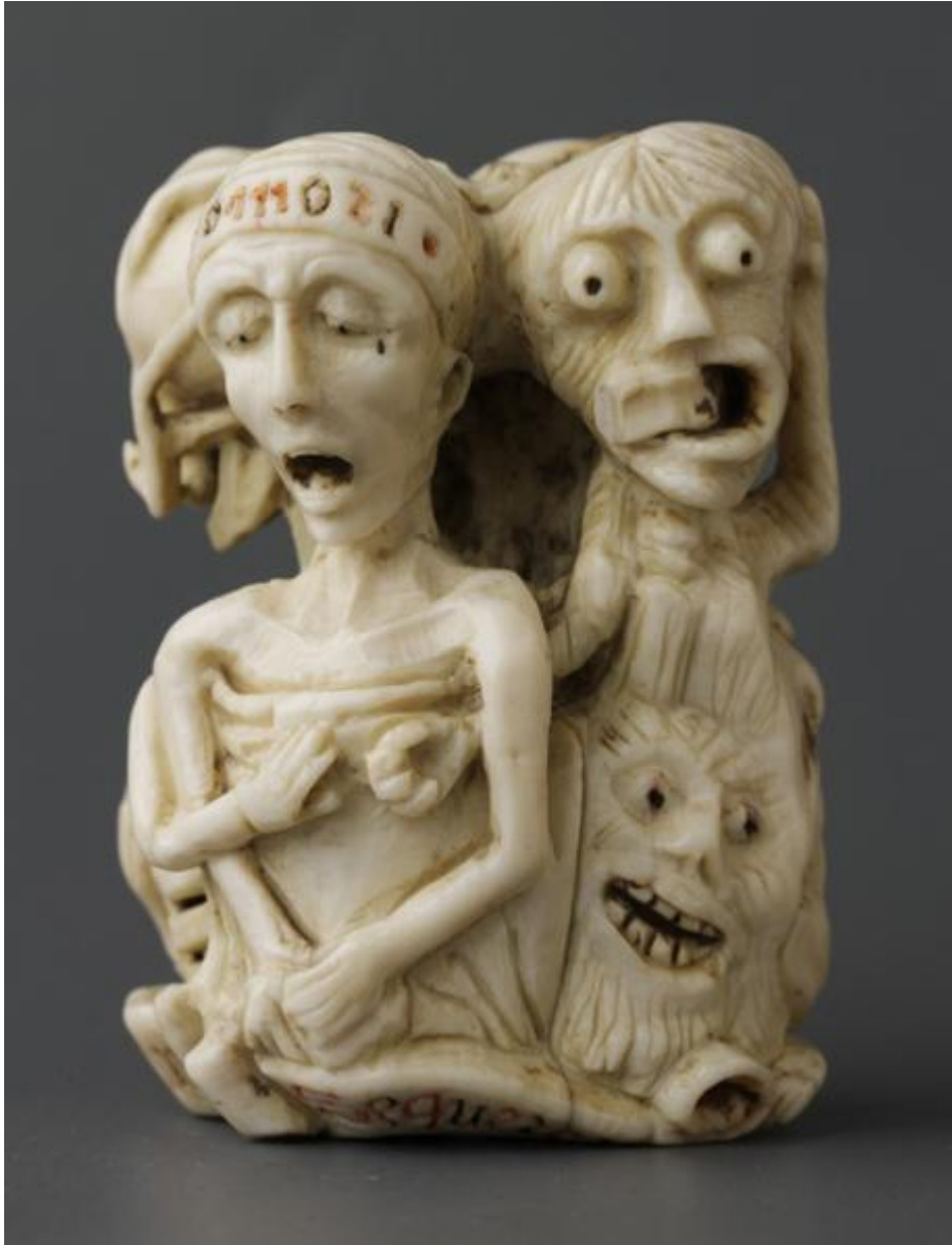
Pendant, memento mori from a chaplet, ivory, circa 1520-1530, northern France or southern Netherlands (Bowdoin College Museum of Art)