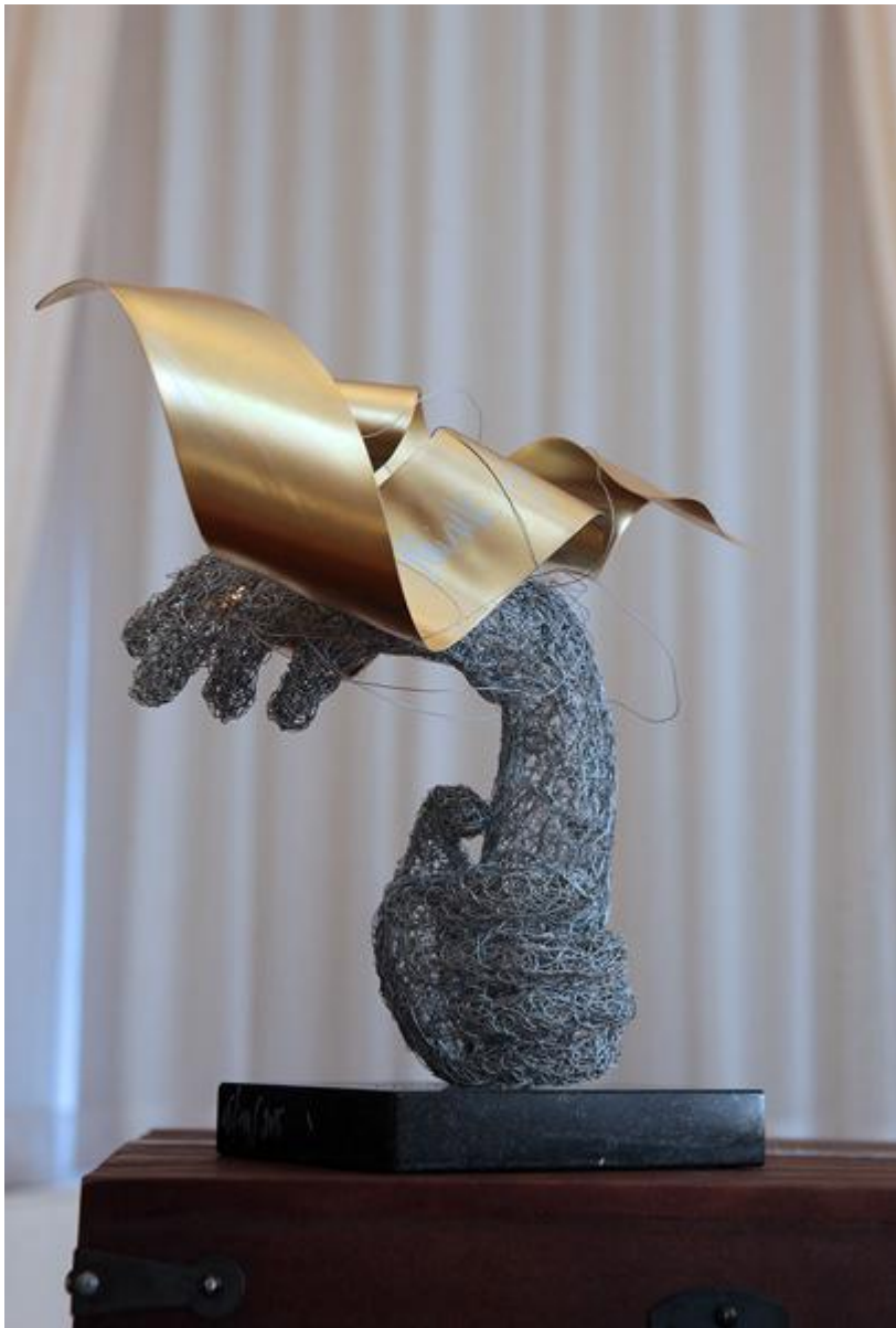
A "Think Freedom" gold-plated sculpture with wire, presented to Pope Francis by Archbishop Luigi Pezzuto