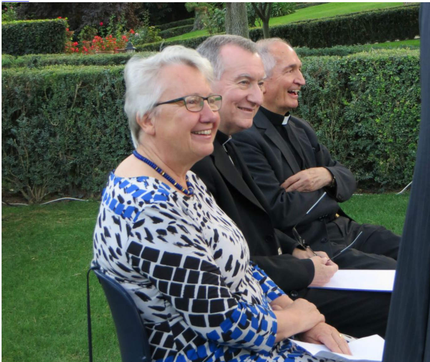
German ambassador to the Holy See Annette Schavan, Cardinal Pietro Parolin and Archbishop Silvano Tomasi are pictured at a U.S. embassy to the Holy See event Sept. 22.