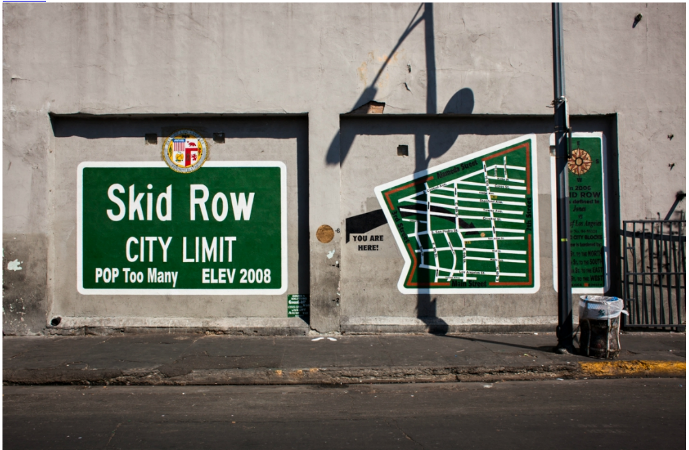
A mural located on San Julian Street in the heart of downtown Los Angeles' skid row