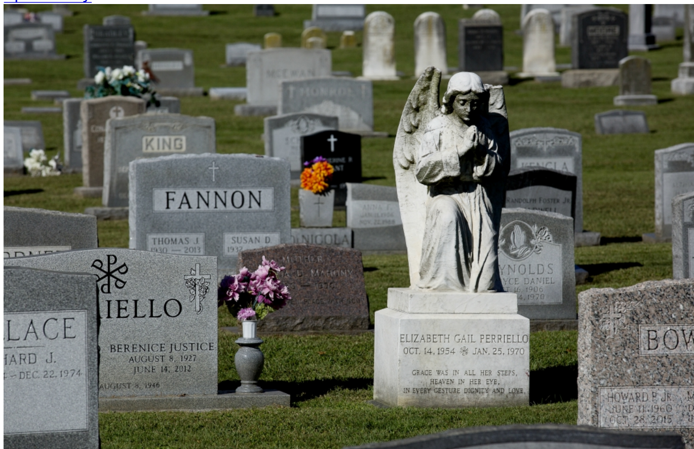
St. Mary Parish's cemetery in Alexandria, Virginia