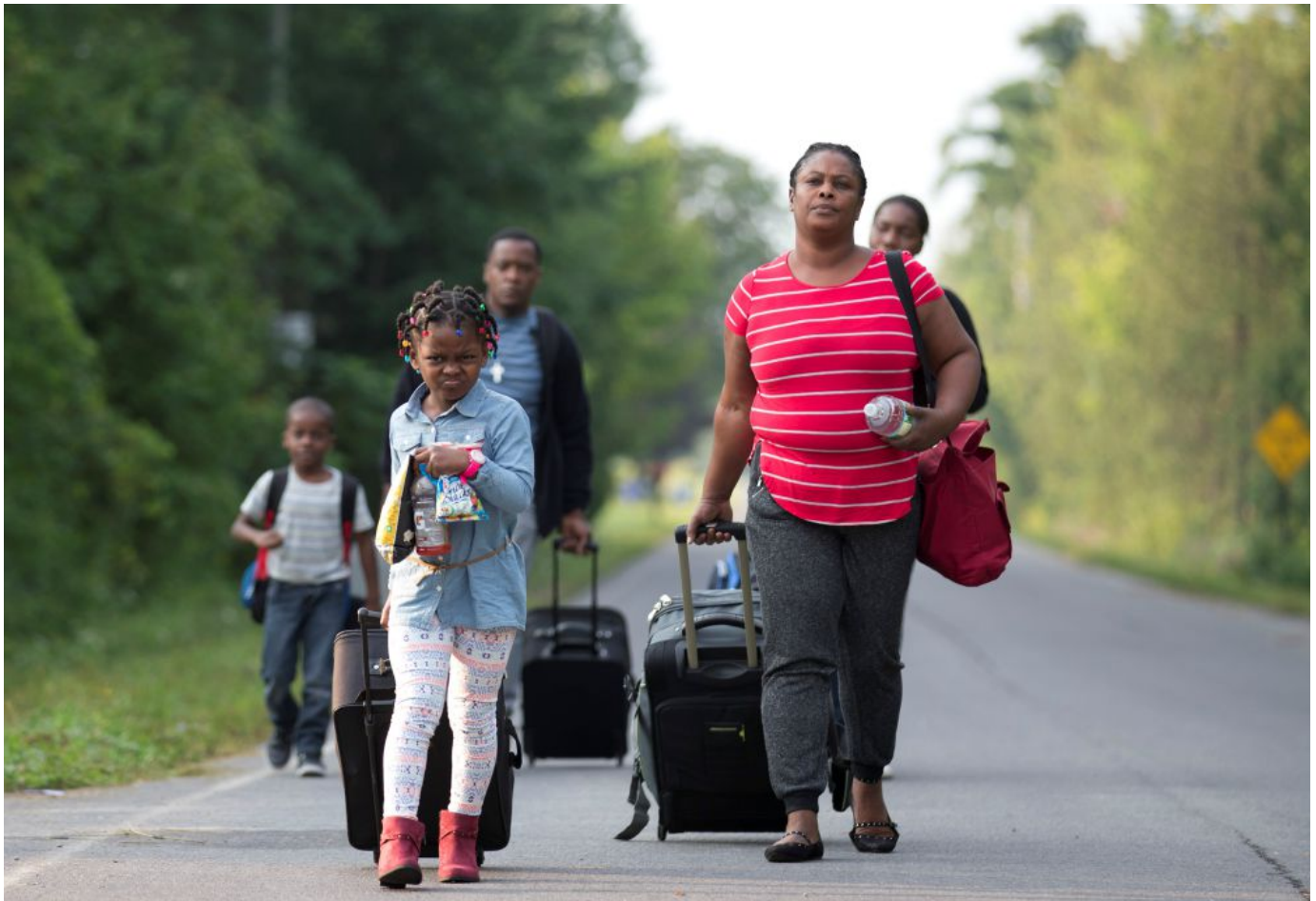
A Haitian family walks to cross the U.S.-Canada border into Quebec from New York Aug. 29.

Briefings from CLINIC on both countries, and an Oct. 31 letter from a coalition of Catholic groups including Catholic Relief Services and the U.S. bishops' Committee on Migration, support the claim that violence, food insecurity and economic conditions make Honduras and El Salvador too dangerous for Temporary Protected Status holders to return.