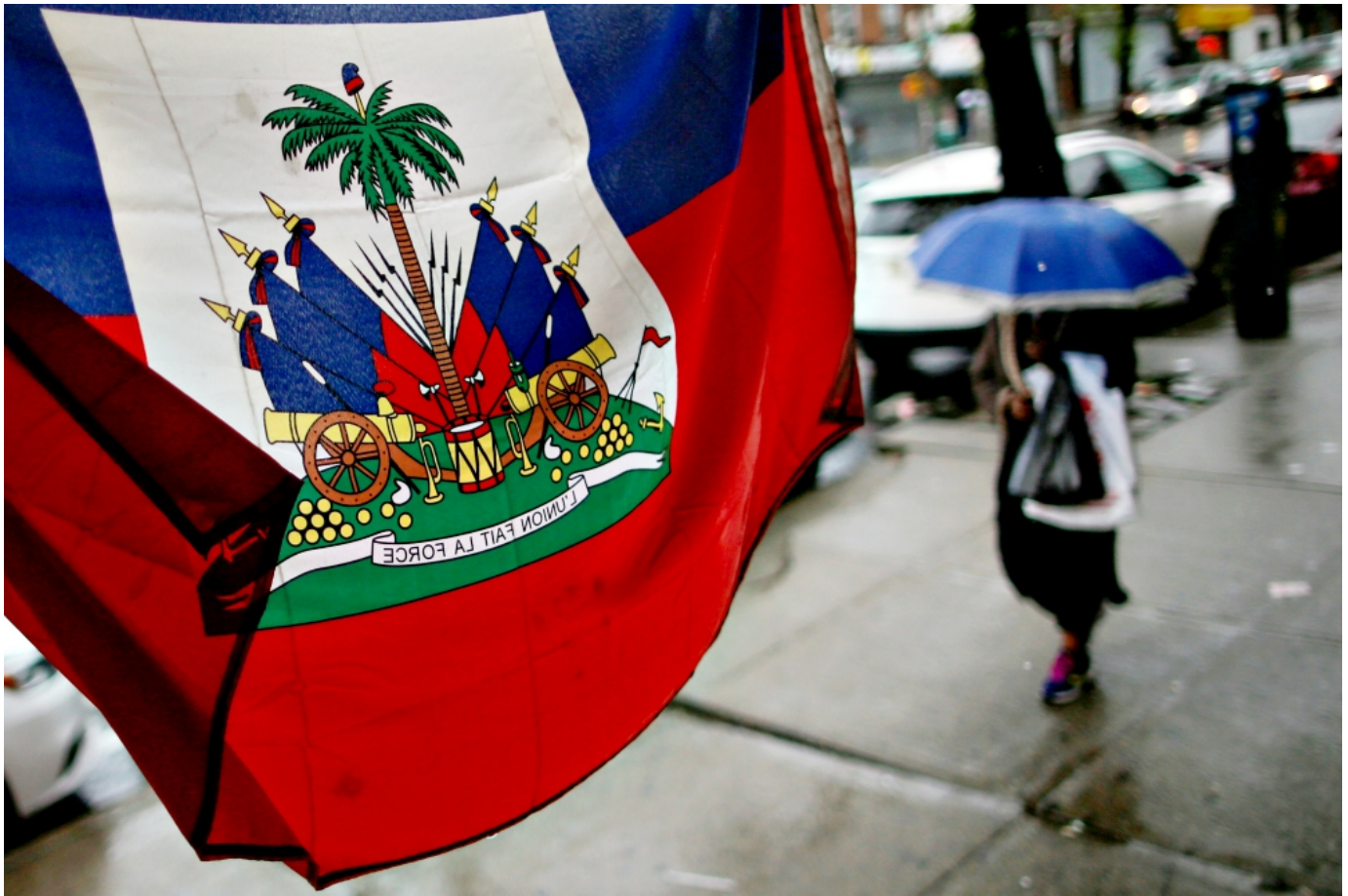
A flag from Haiti hangs outside a store as a woman walks with an umbrella May 13 in Brooklyn, New York.