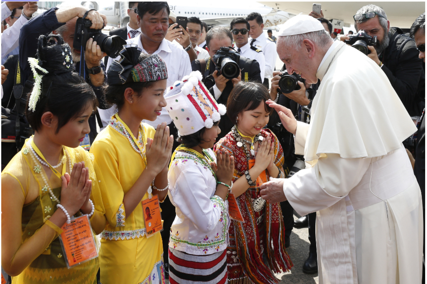
Pope Francis greets children as he arrives at Yangon International Airport in Yangon, Myanmar, Nov. 27.