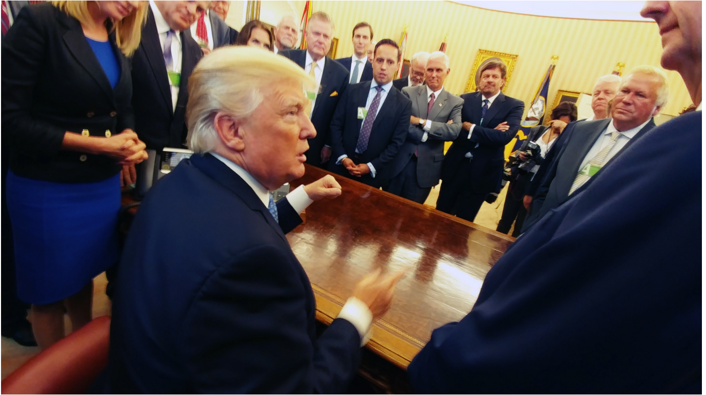
President Trump meets with faith leaders inside the Oval Office on July 10, 2017.

2018 will likely see white evangelical Protestants remaining locked in for Republican candidates in the midterm elections. According to the exit polls, 81 percent of white evangelical Protestant voters pulled the lever for Donald Trump in the 2016 presidential election, and they strongly supported the president throughout his first year in office.