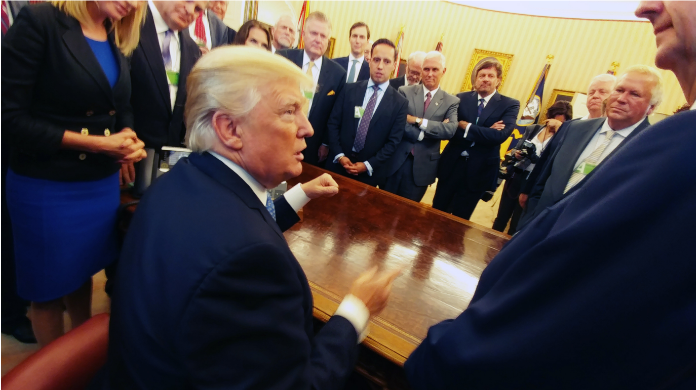
President Trump meets with faith leaders inside the Oval Office on July 10, 2017.

2018 will likely see white evangelical Protestants remaining locked in for Republican candidates in the midterm elections. According to the exit polls, 81 percent of white evangelical Protestant voters pulled the lever for Donald Trump in the 2016 presidential election, and they strongly supported the president throughout his first year in office.