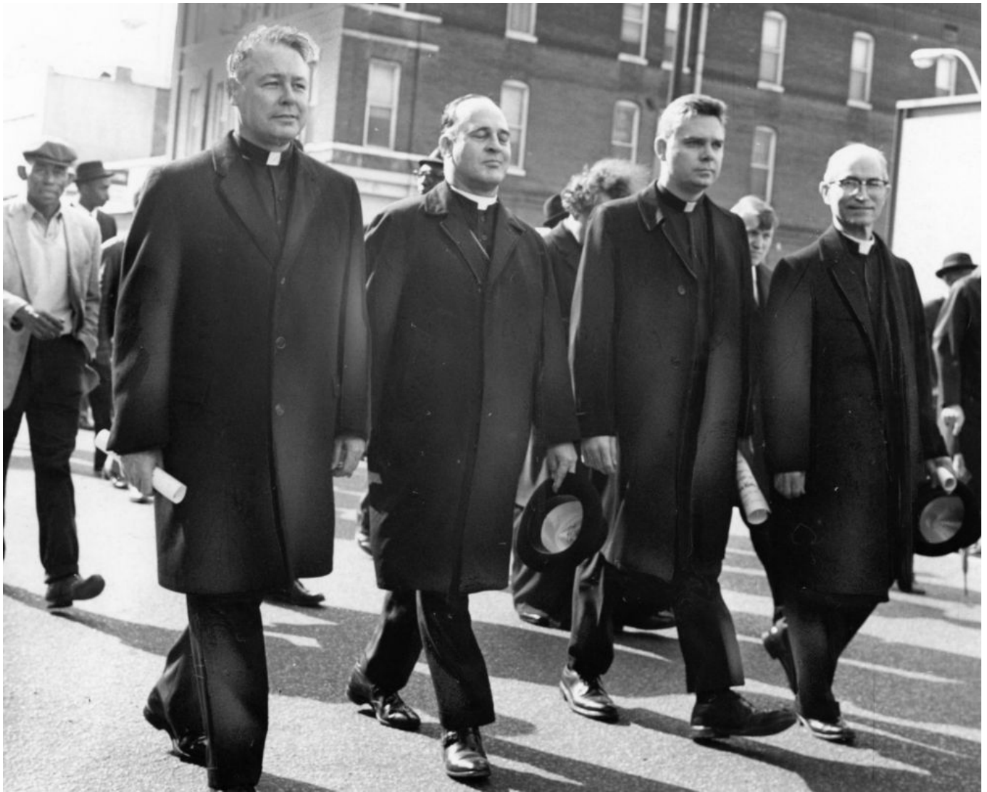
Cardinal Bernard Law, second from right, is pictured during a 1969 march to the Lorraine Hotel in Memphis, Tennessee, for a memorial service for the Rev. Martin Luther King Jr.

Ordained in 1961 for the Diocese of Natchez-Jackson, in Mississippi, Law became a champion for the rural poor and the civil rights movement and received death threats for that work. He was a pioneer in ecumenical relations, which took him in 1968 to his first national office in the U.S. bishops' conference.