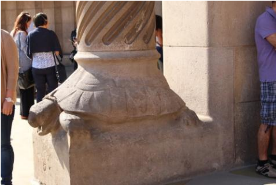
A turtle is seen at the base of a pillar of the Sagrada Família in Barcelona, Spain.