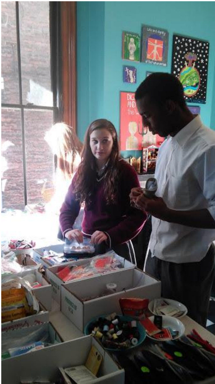
Students from Central Catholic High School help assemble Christmas gifts for the homeless at the House of Hagar.