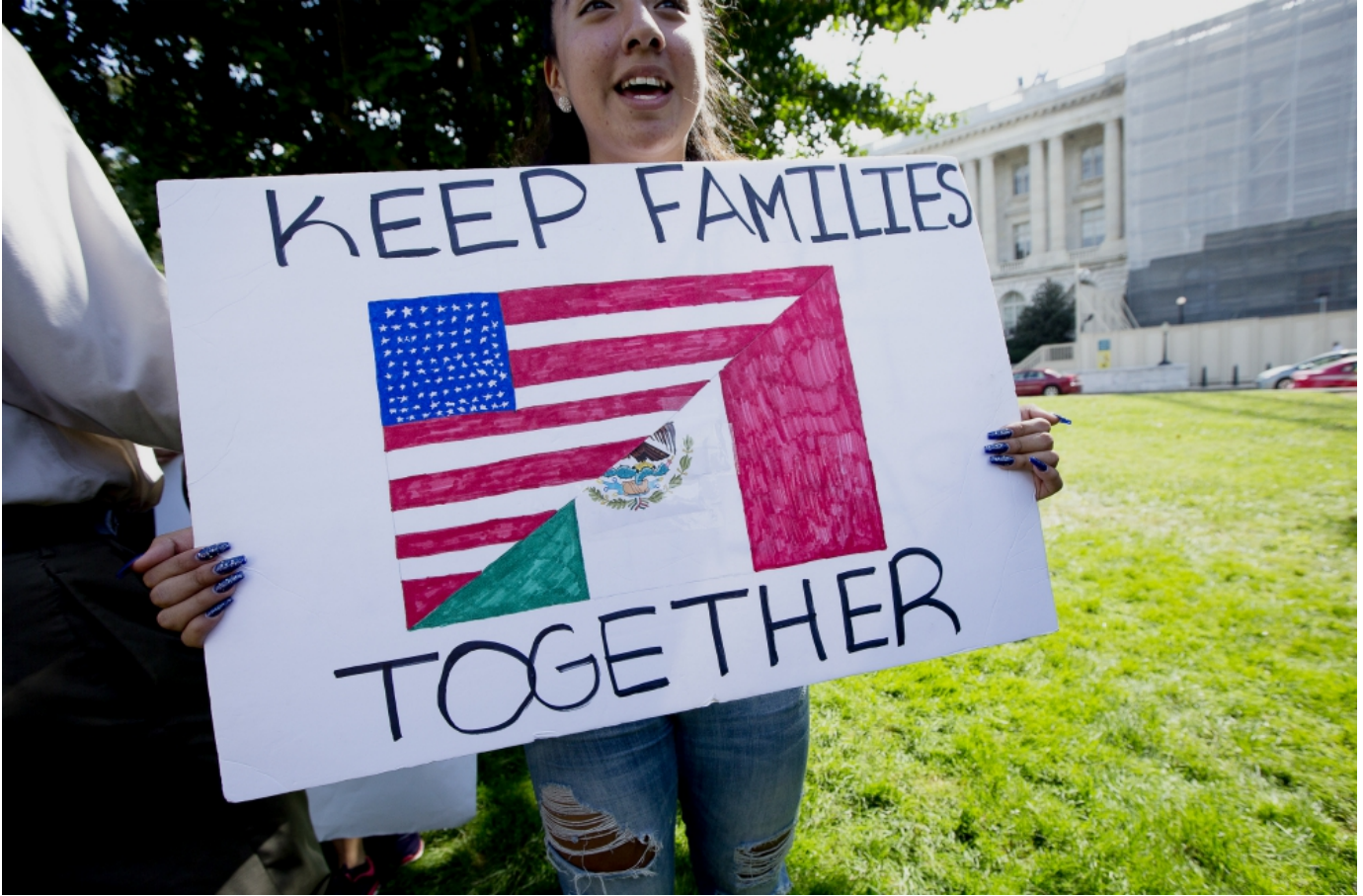
A participant at an immigration rally is seen near the U.S. Capitol in Washington Sept. 26, 2017.