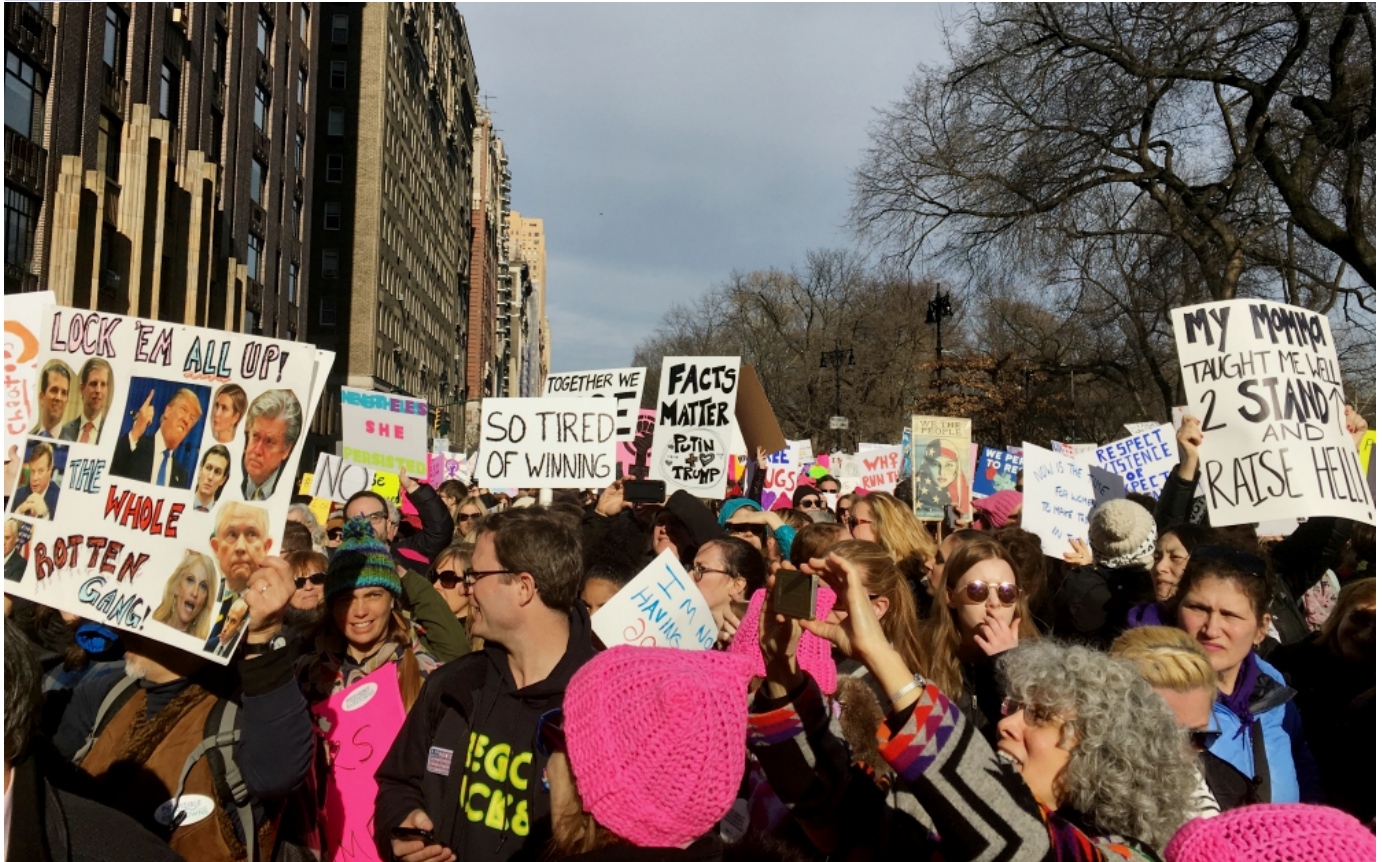
Signs display spirited messages at the 2018 Women's March in New York City