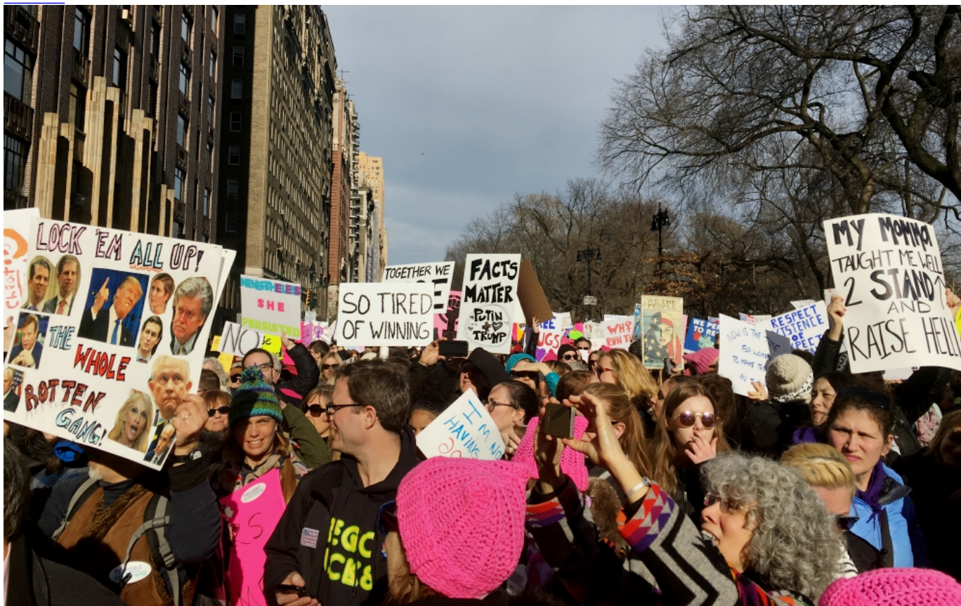
Signs display spirited messages at the 2018 Women's March in New York City