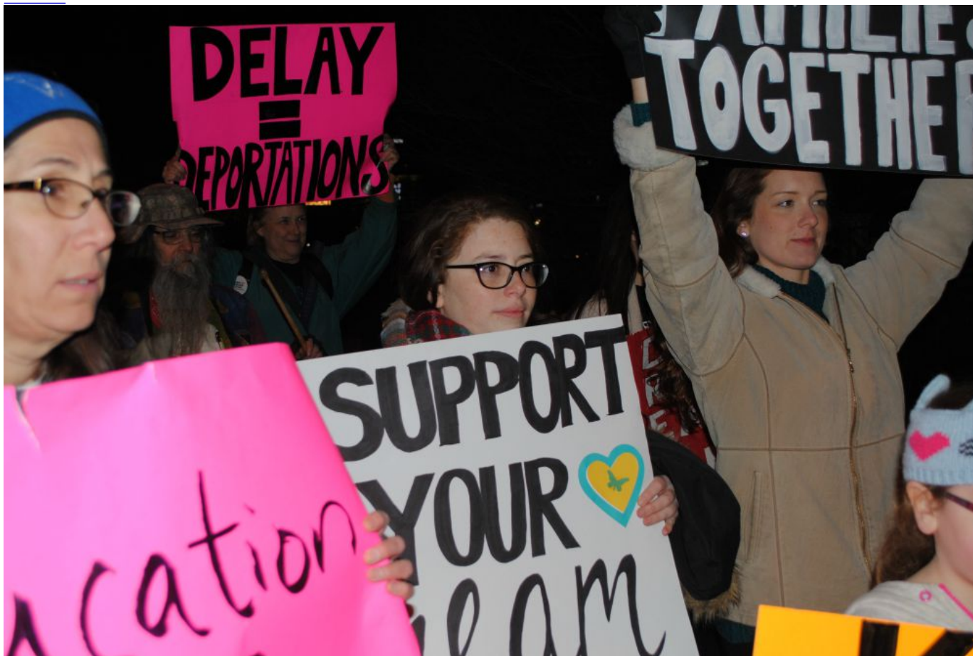
Protesters carry signs and chant slogans as they participate in a Dream Act Now march in Kansas City, Missouri, March 2.