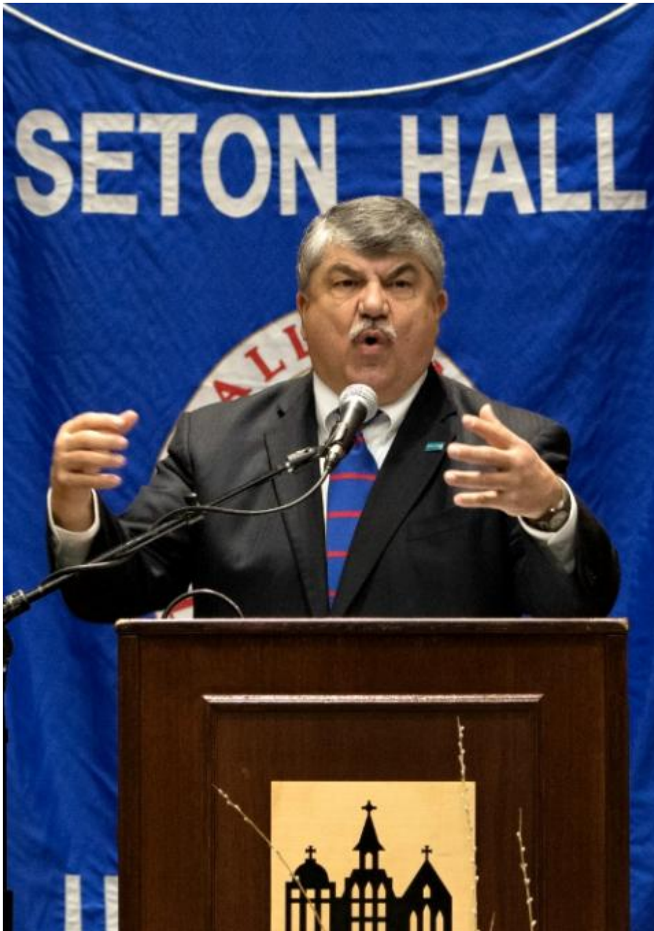
Richard Trumka speaks about Pope Francis March 6 at Seton Hall University in South Orange, New Jersey.

All three speakers at the March 6 event — Trumka, Cardinal Joseph Tobin of Newark, New Jersey, and New Jersey Gov. Phil Murphy — were repeatedly interrupted by applause as they quoted different statements our Holy Father has made. Among the seasoned church-watchers in the press corps, there was widespread agreement that Trumka understands Francis better than half the bishops and many theologians.