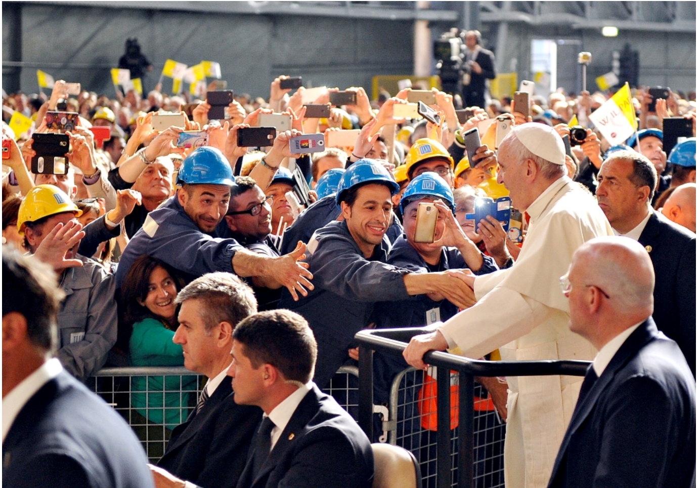
Pope Francis greets workers as he arrives at the ILVA steel plant during a May 2017 pastoral visit in Genoa, Italy.