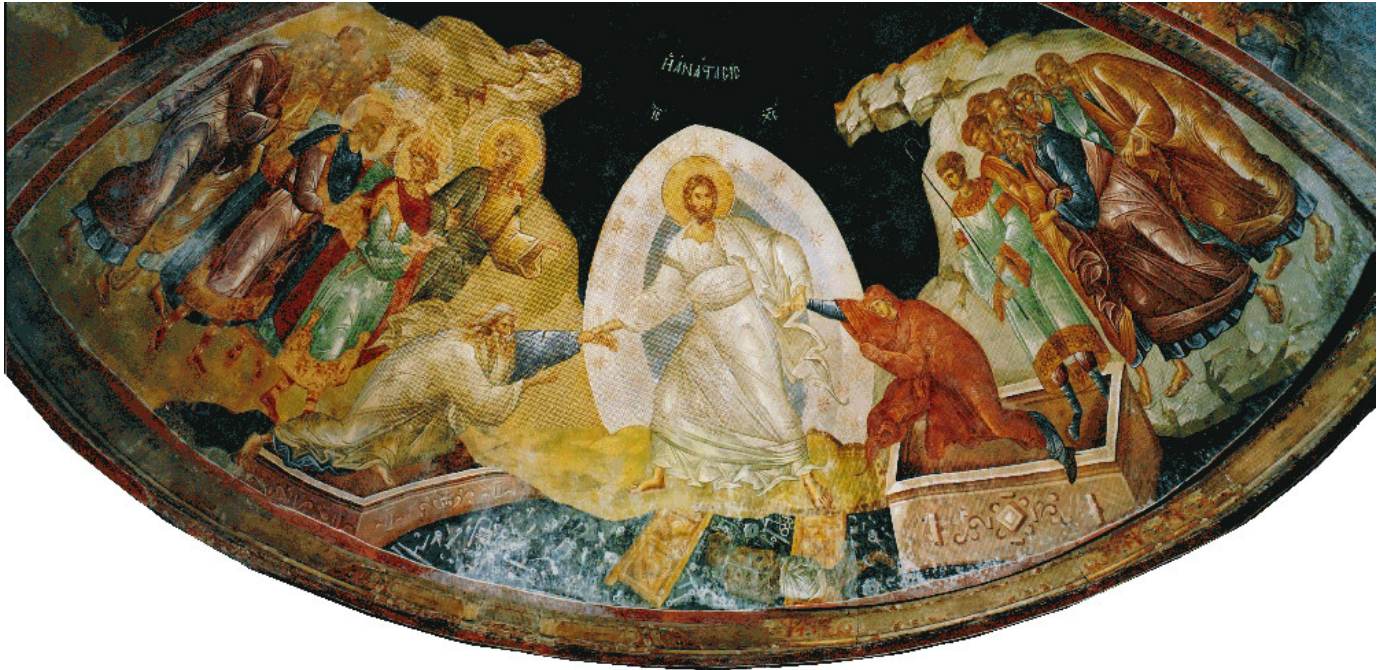
Image of anastasis, or Resurrection, inside of Chora Church Museum, in Istanbul, Turkey (Sarah Sexton Crossan)