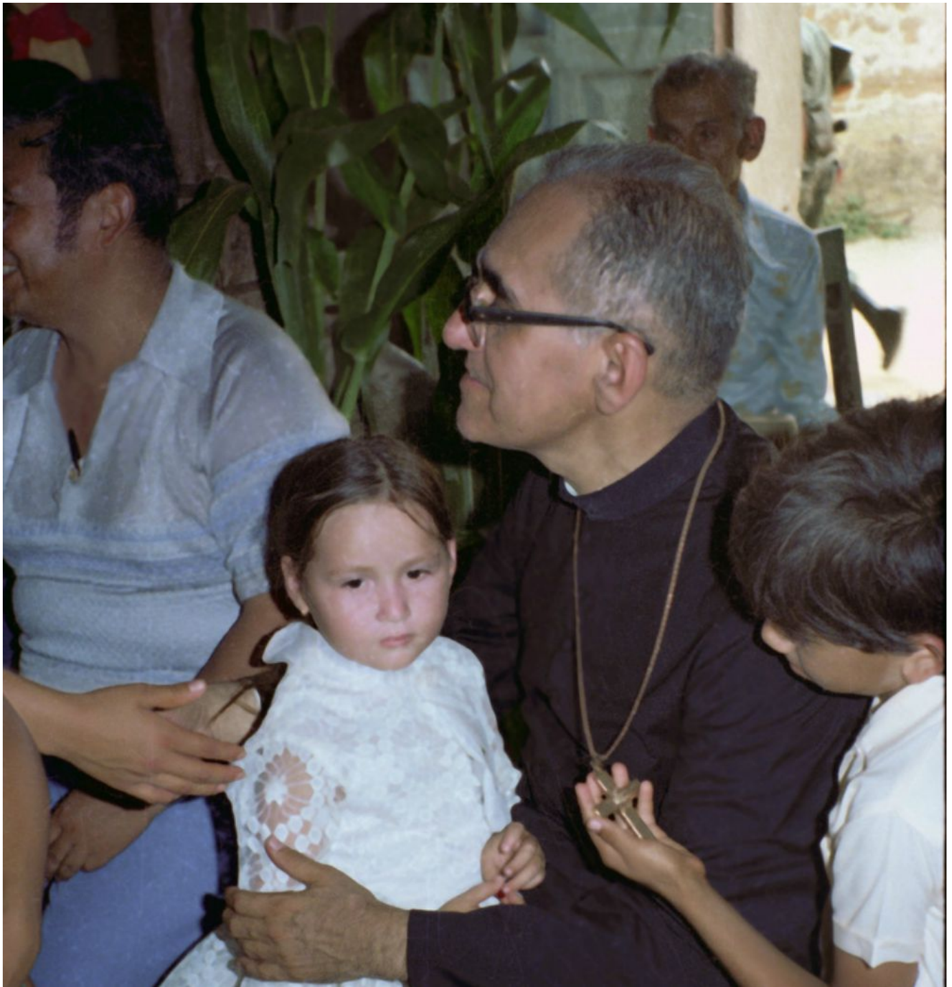
Archbishop Óscar Romero is pictured inside the church at San Antonio Los Ranchos in Chalatenango, El Salvador, in 1979.