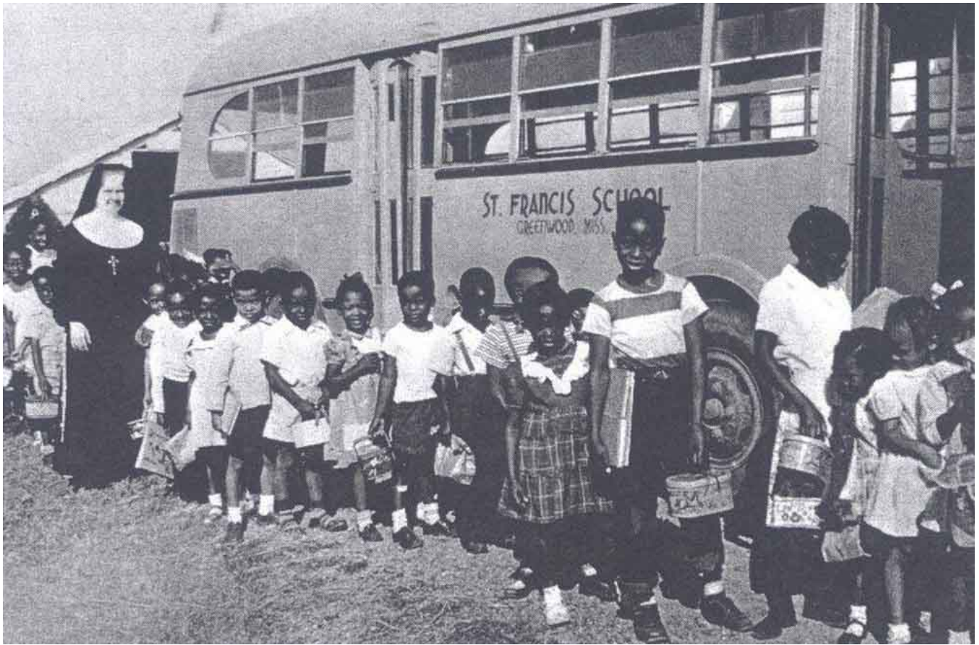
A sister with the first pupils at St. Francis School