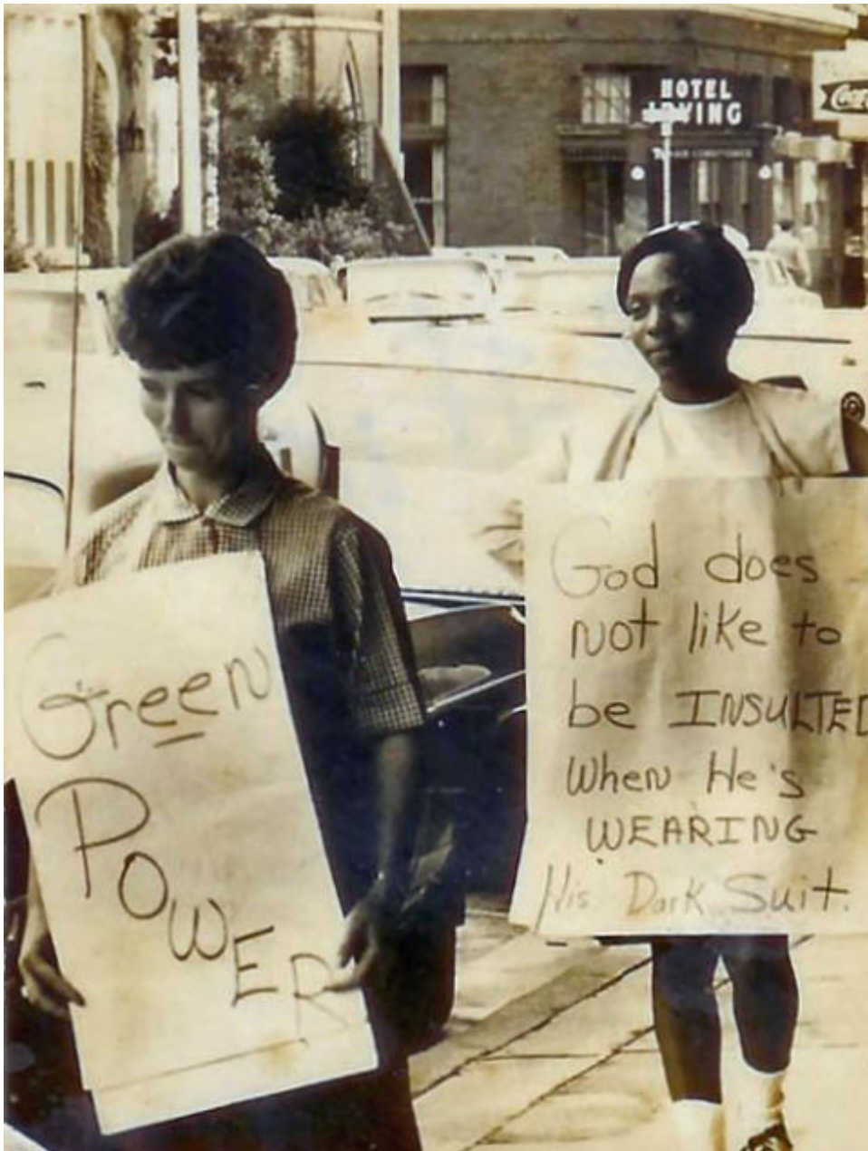
Young people prepare to picket during of boycott Greenwood merchants in 1968.