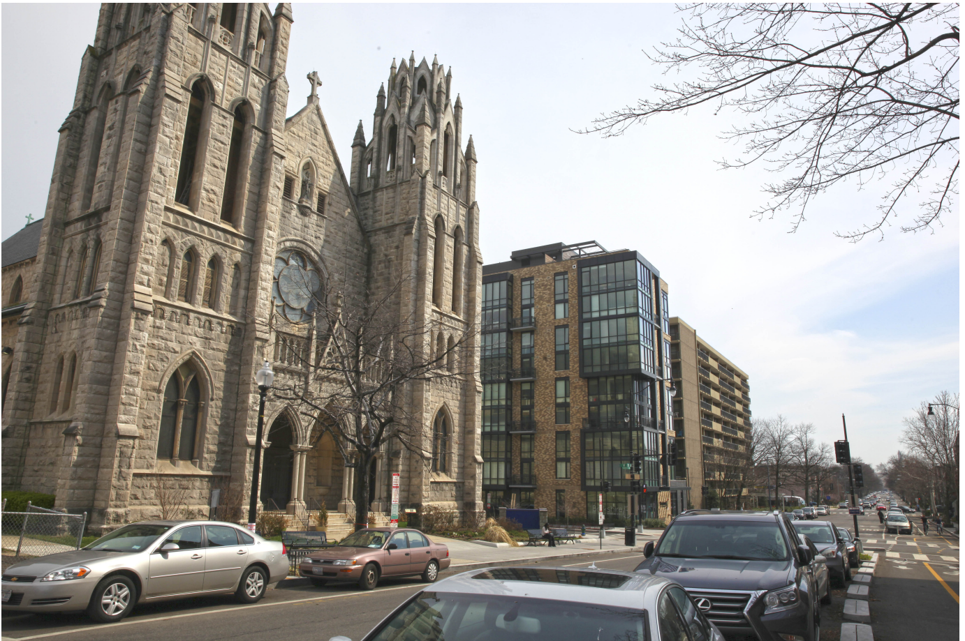
St. Augustine Catholic Church is near newer condominiums in Washington, D.C.

"I realized we couldn't wait for people to come to us. We had to go out to the community." The priest, now 77, was elected to a seat on the city's school board four years after the assassination and still remains well-connected in Washington's political and civic circles. He passes social justice lessons on at Georgetown University, where his popular class, "The Church and The Poor," helps students make sense of the Catholic social tradition by providing real life exposure to leading activists, civil rights attorneys and other community leaders in Washington.