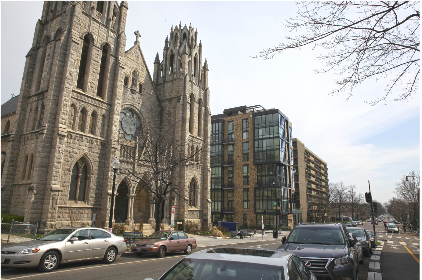
St. Augustine Catholic Church is near newer condominiums in Washington, D.C.

"I realized we couldn't wait for people to come to us. We had to go out to the community." The priest, now 77, was elected to a seat on the city's school board four years after the assassination and still remains well-connected in Washington's political and civic circles. He passes social justice lessons on at Georgetown University, where his popular class, "The Church and The Poor," helps students make sense of the Catholic social tradition by providing real life exposure to leading activists, civil rights attorneys and other community leaders in Washington.