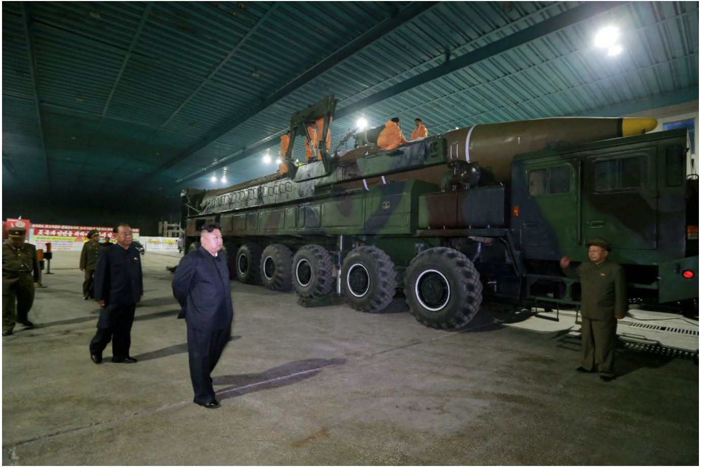
North Korean leader Kim Jong Un inspects the intercontinental ballistic missile Hwasong-14 in this undated photo released by North Korea's Korean Central News Agency.