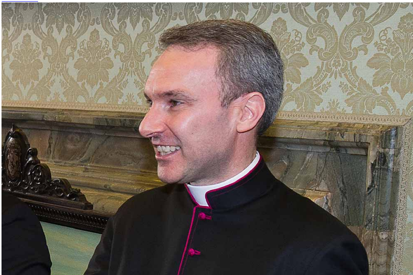
Msgr. Carlo Capella, pictured at the Vatican in 2015