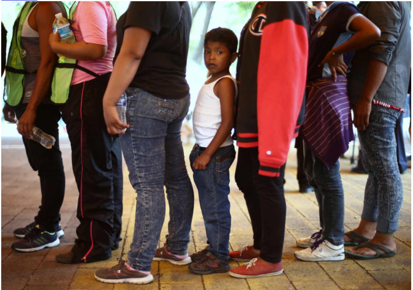
Central American migrants stand in line for food at a shelter set up for them by the Catholic Church in Puebla, Mexico, April 6.