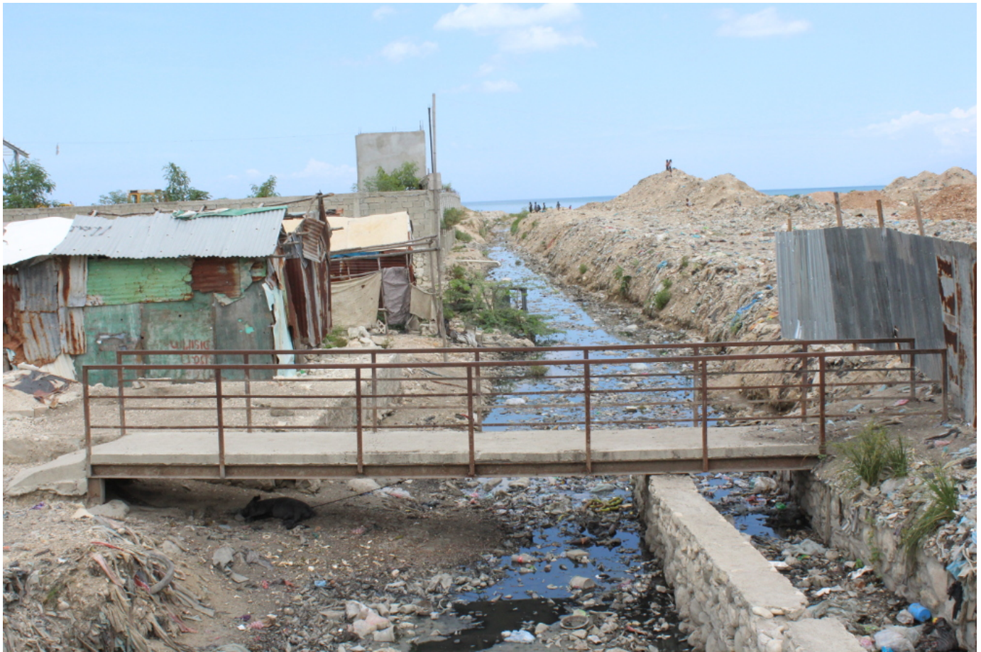
Cap-Haïtien is at Haiti's northern tip.

"We are Haitians. Sometimes we go without food for two days or more."