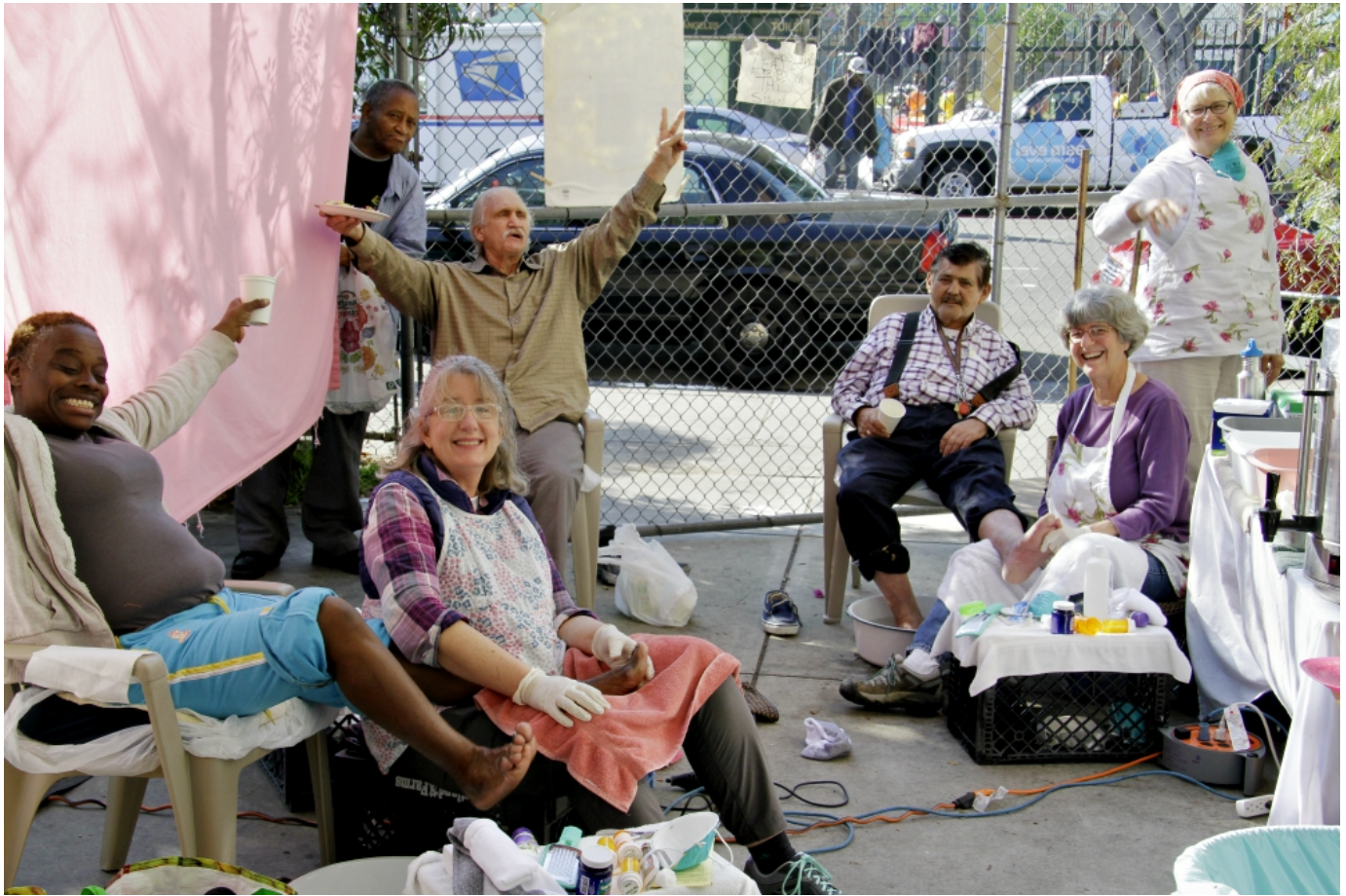
Volunteers provide foot care for patients during one of the Los Angeles Catholic Worker's weekly health outreach days. (Michael Wisniewski)

This decentralized, even anarchist, approach has led Catholic Worker communities to develop in a variety of formats and to carry out a spectrum of ministries that are limited only by their members' interests, resources and creativity.