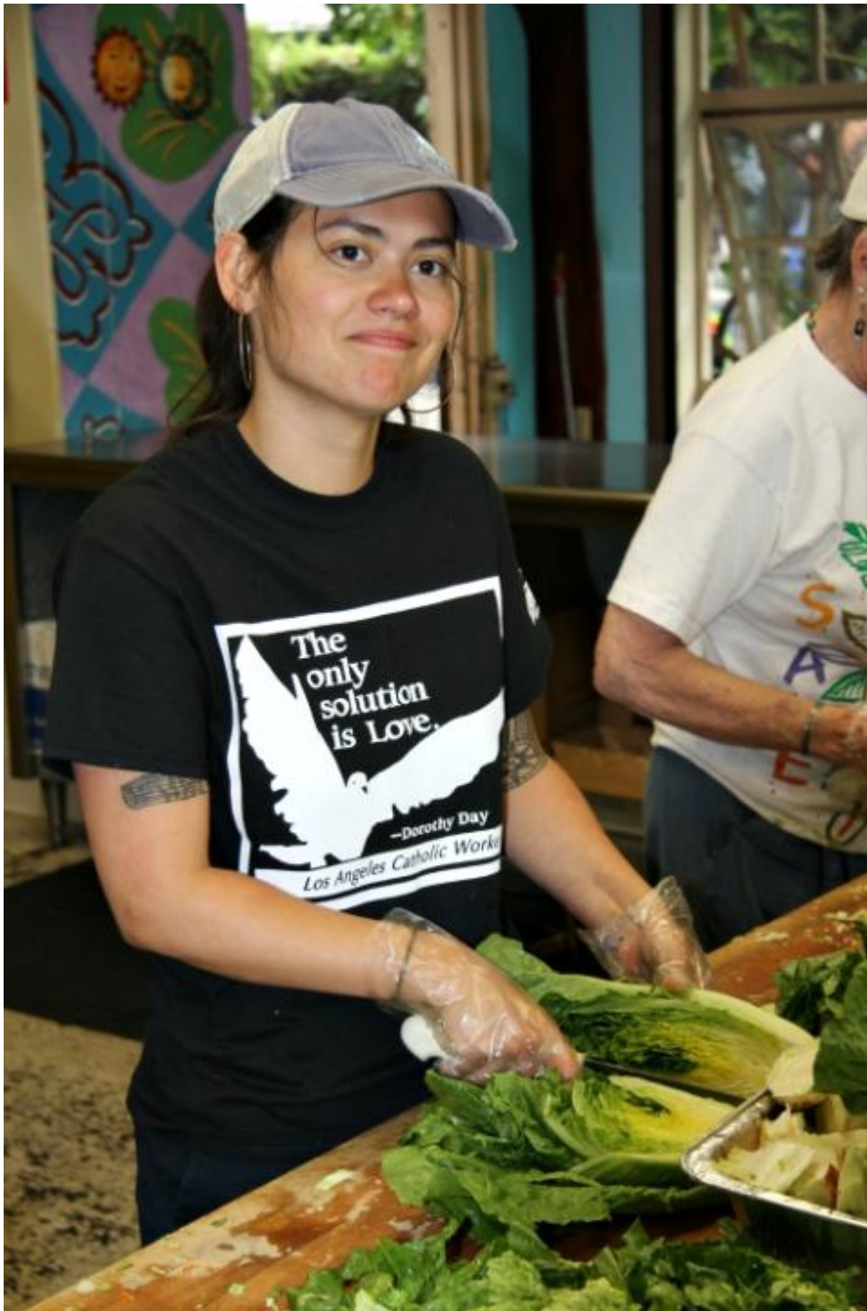
Food preparation at the Los Angeles Catholic Worker

However, even these communities don't make Catholicism a requirement for those who might like to join, and the movement resonates with non-Catholics as well.