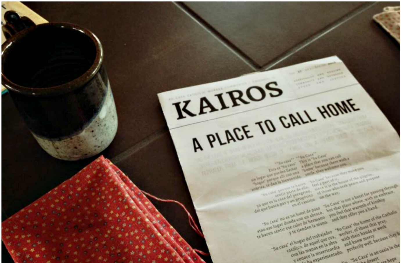
A copy of the Kairos newsletter for Su Casa Catholic Worker house in Chicago