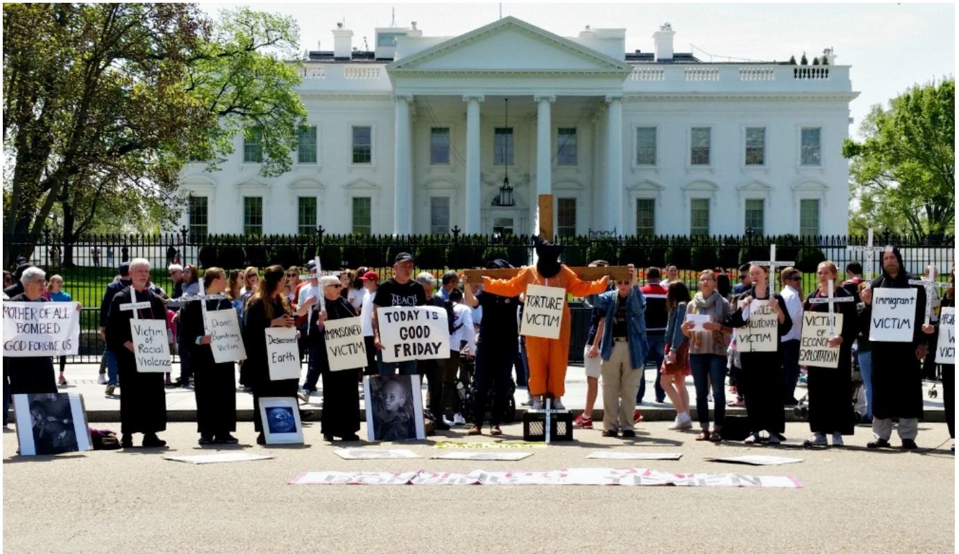
A 2017 Good Friday witness sponsored by the Dorothy Day Catholic Worker in Washington, D.C., protests "contemporary crucifixion" outside the White House.