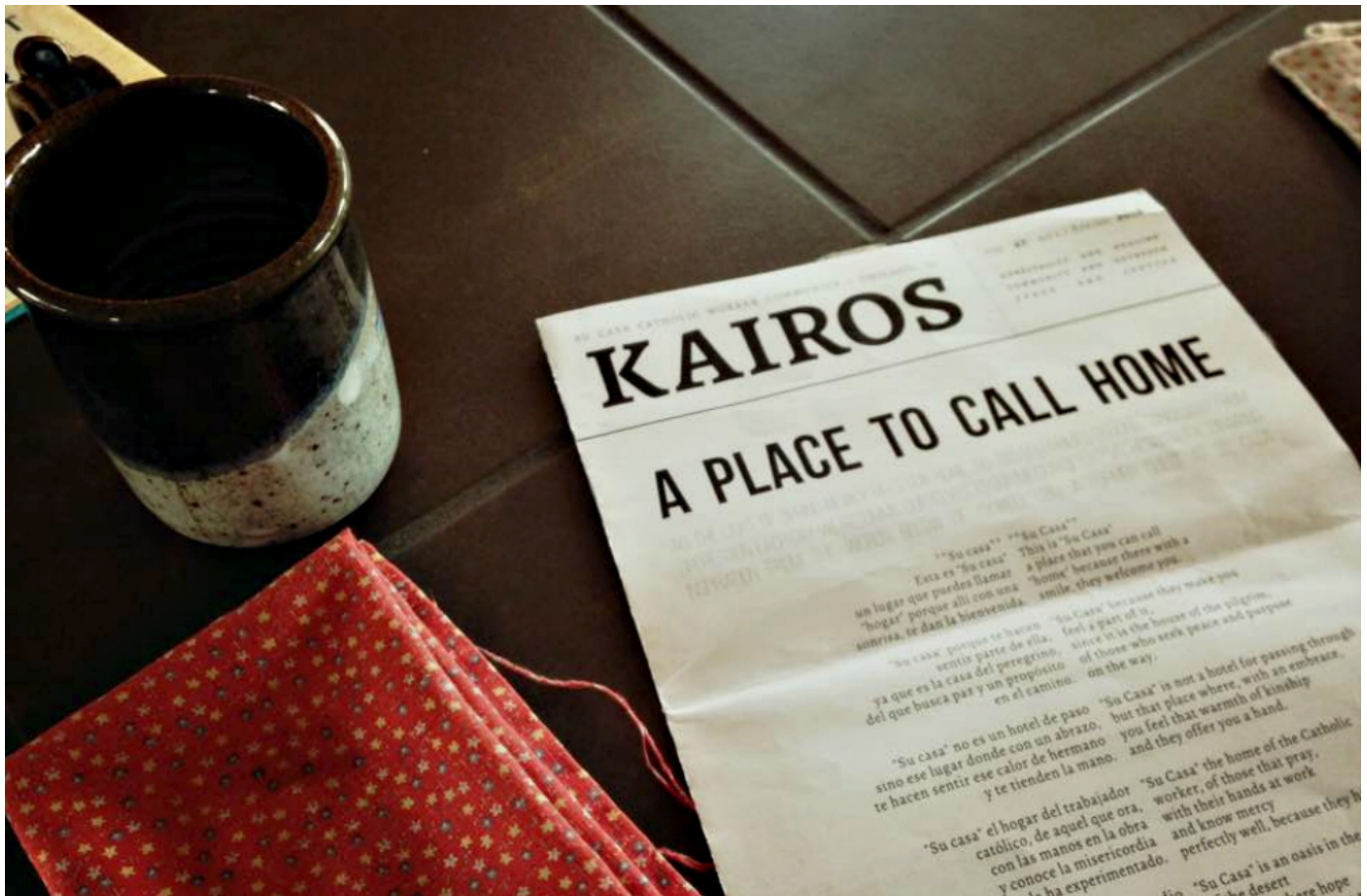
A copy of the Kairos newsletter for Su Casa Catholic Worker house in Chicago