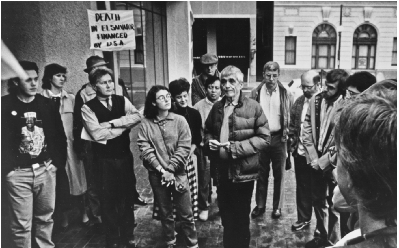
Jesuit Fr. Daniel Berrigan, center, talks to a group of supporters outside the federal courthouse in New Orleans prior to his trial for contempt of court Feb. 8, 1990. Actor Martin Sheen; second from left, testified at the trial.

On this score, too, the church has evolved. In November 2017, Pope Francis declared: "Weapons of mass destruction, particularly nuclear weapons, create nothing but a false sense of security. They cannot constitute the basis for peaceful coexistence between members of the human family."