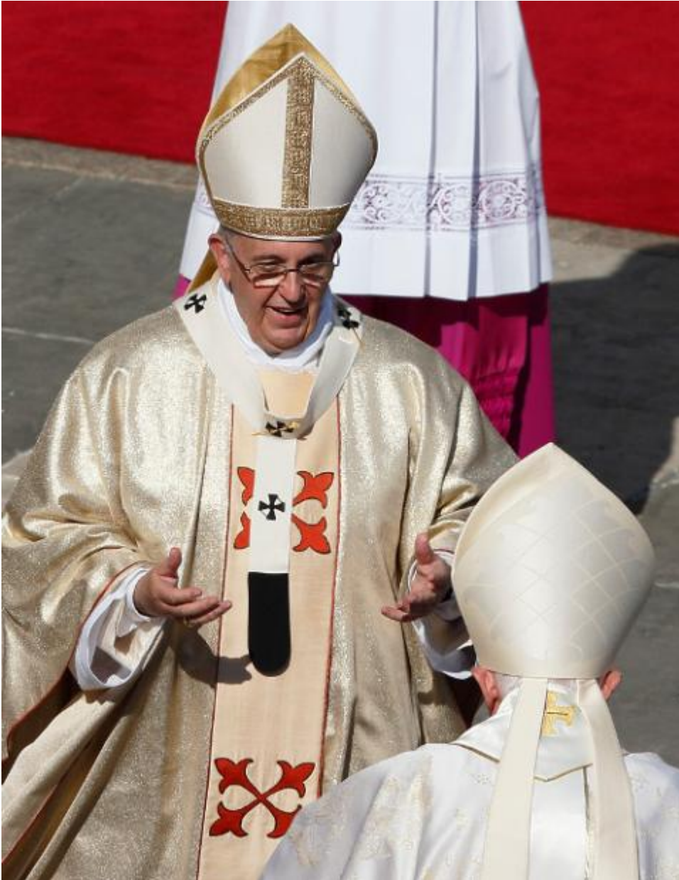
Pope Francis greets retired Pope Benedict XVI at the beatification Mass of Blessed Paul VI in St. Peter's Square at the Vatican Oct. 19, 2014.

be taken up anew" and " 'the use of methods based on the laws of nature and the incidence of fertility' ( Humanae Vitae , 11) are to be promoted," it is " 'the parents themselves and no one else [who] should ultimately make this judgment in the sight of God' " ( Amoris Laetitia 222, quoting Gaudium et Spes , 50).