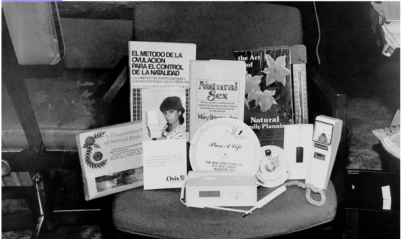
Natural family planning paraphernalia, circa 1983