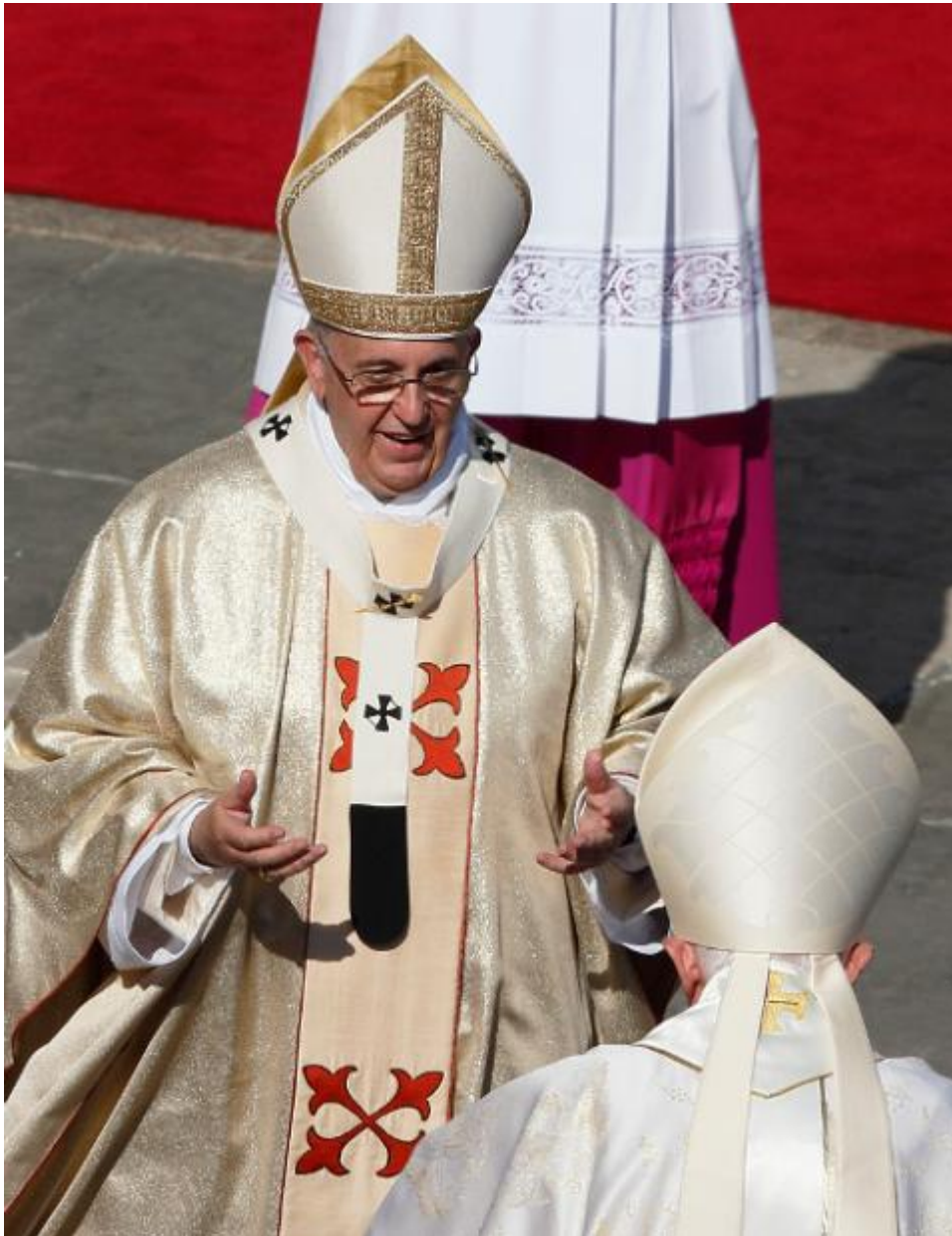
Pope Francis greets retired Pope Benedict XVI at the beatification Mass of Blessed Paul VI in St. Peter's Square at the Vatican Oct. 19, 2014.

taken up anew" and " 'the use of methods based on the laws of nature and the incidence of fertility' ( Humanae Vitae , 11) are to be promoted," it is " 'the parents themselves and no one else [who] should ultimately make this judgment in the sight of God' " ( Amoris Laetitia 222, quoting Gaudium et Spes , 50).