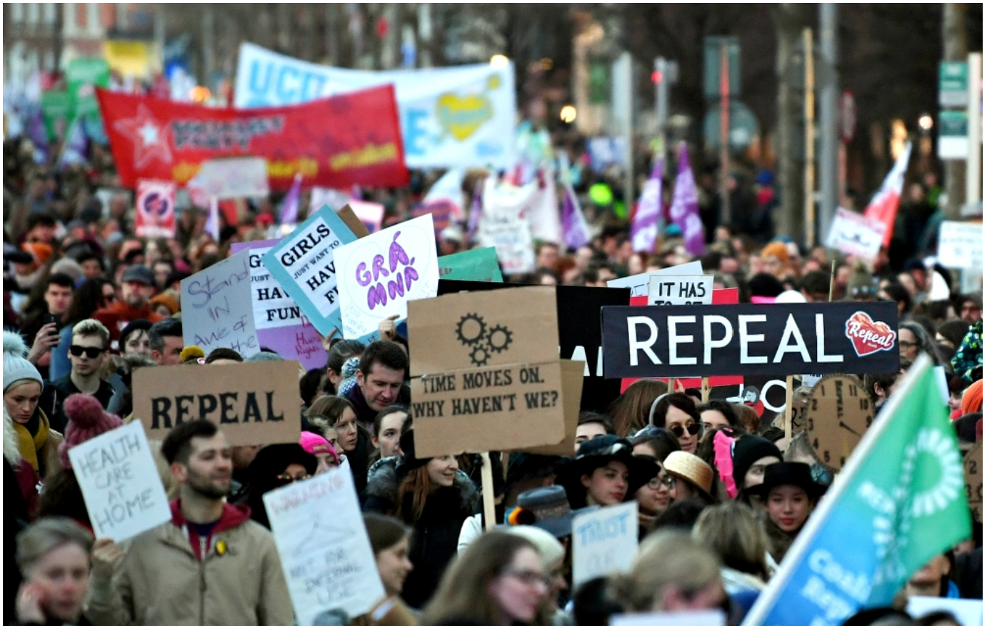
Demonstrators march for more liberal Irish abortion laws March 8 in Dublin.