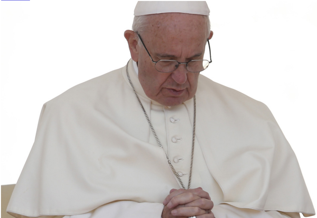
Pope Francis