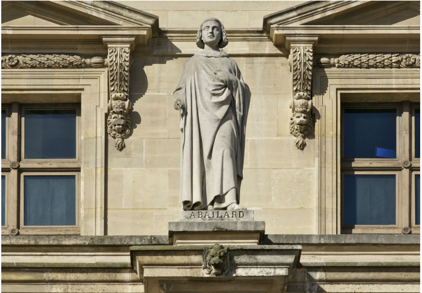
Statue of Peter Abelard by Jules Cavelier (circa 1853) on the facade of the Louvre Palace, in the Napoléon courtyard, Paris, France, pictured in 2012.