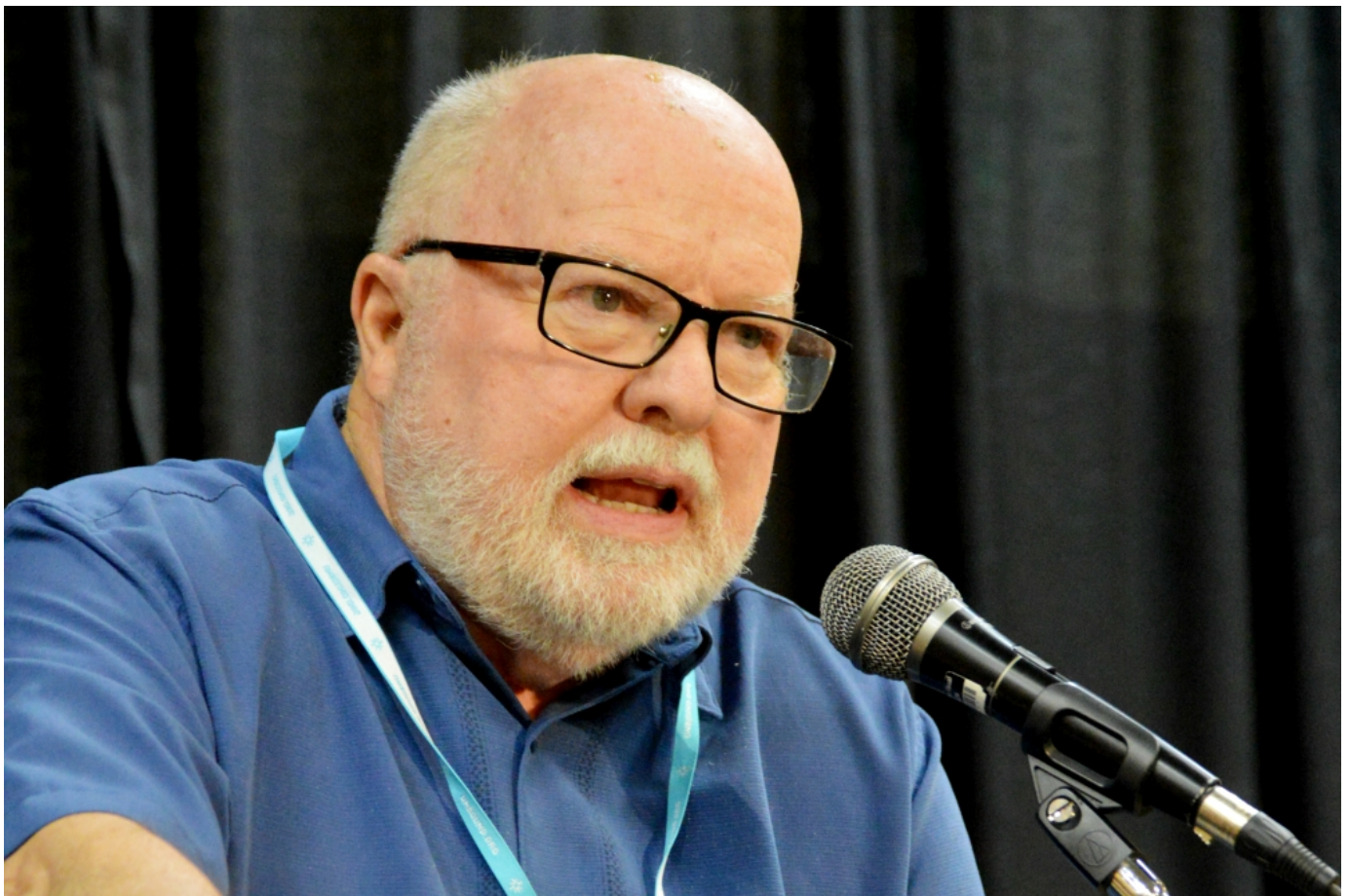
Franciscan Fr. Richard Rohr addresses the Association of U.S. Catholic Priests' annual Assembly June 26 in Albuquerque, New Mexico.

Franciscan Fr. Richard Rohr, a well-known author and lecturer on spirituality and contemplation, spoke to the assembly June 26 and led the group in a half-day retreat June 27.