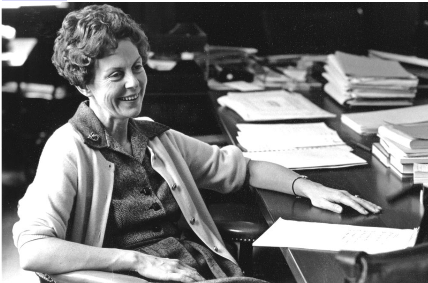
Jill Ker Conway