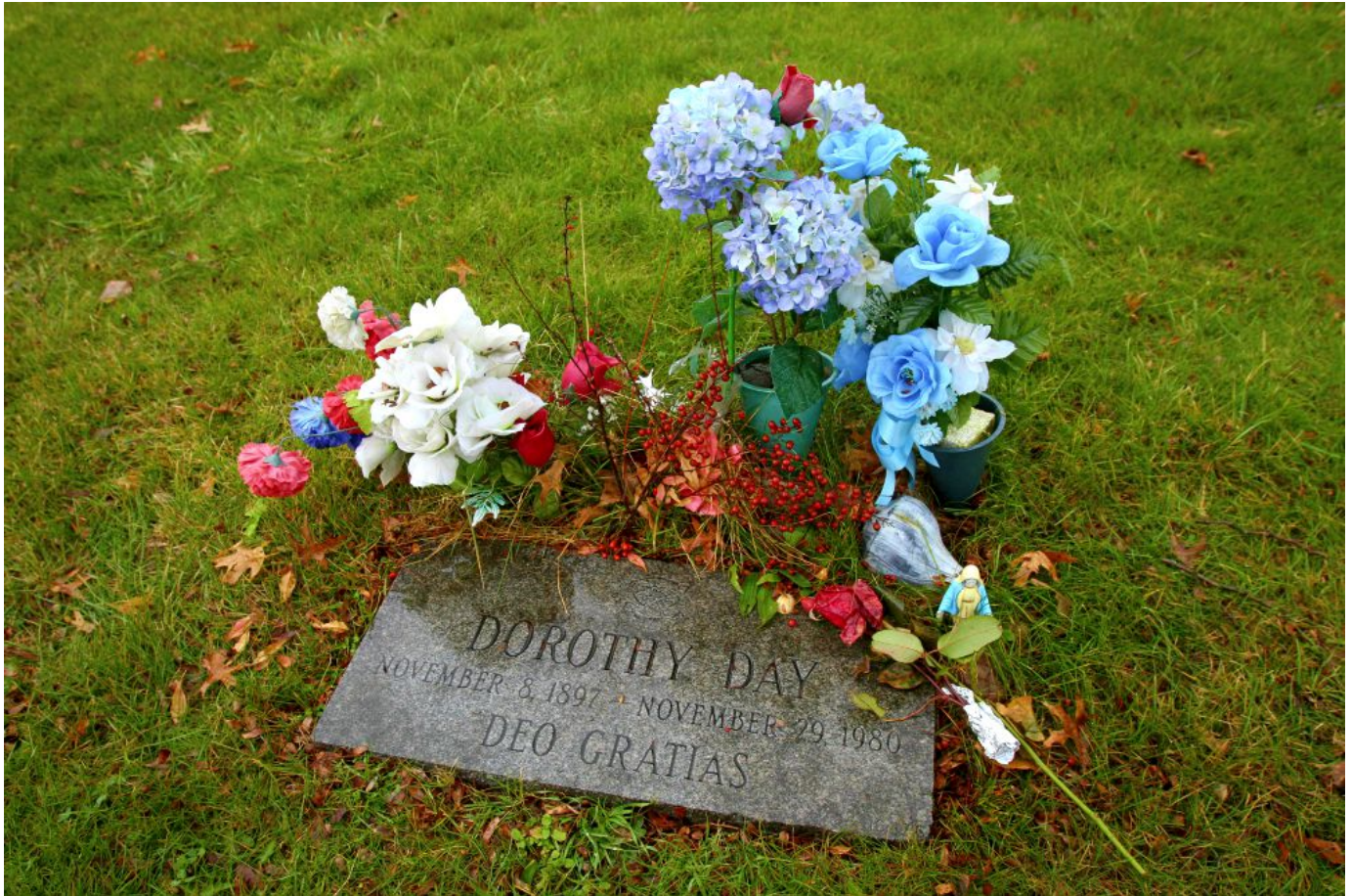
The grave of Dorothy Day at Cemetery of the Resurrection in the Staten Island borough of New York, pictured Dec. 9, 2012