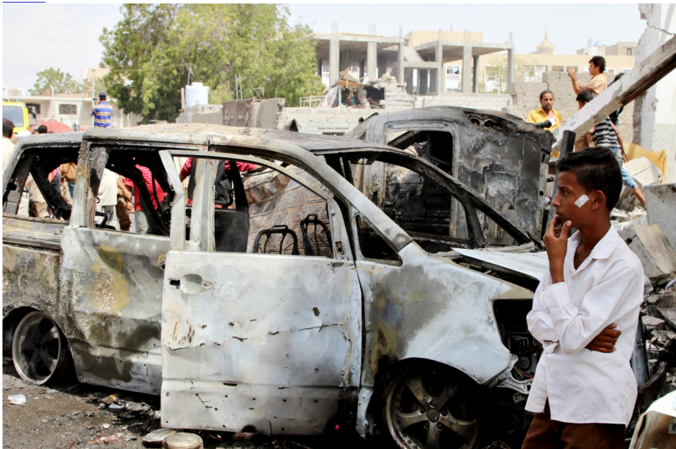
People inspect the damages after a car bombing March 13 in Aden, Yemen.