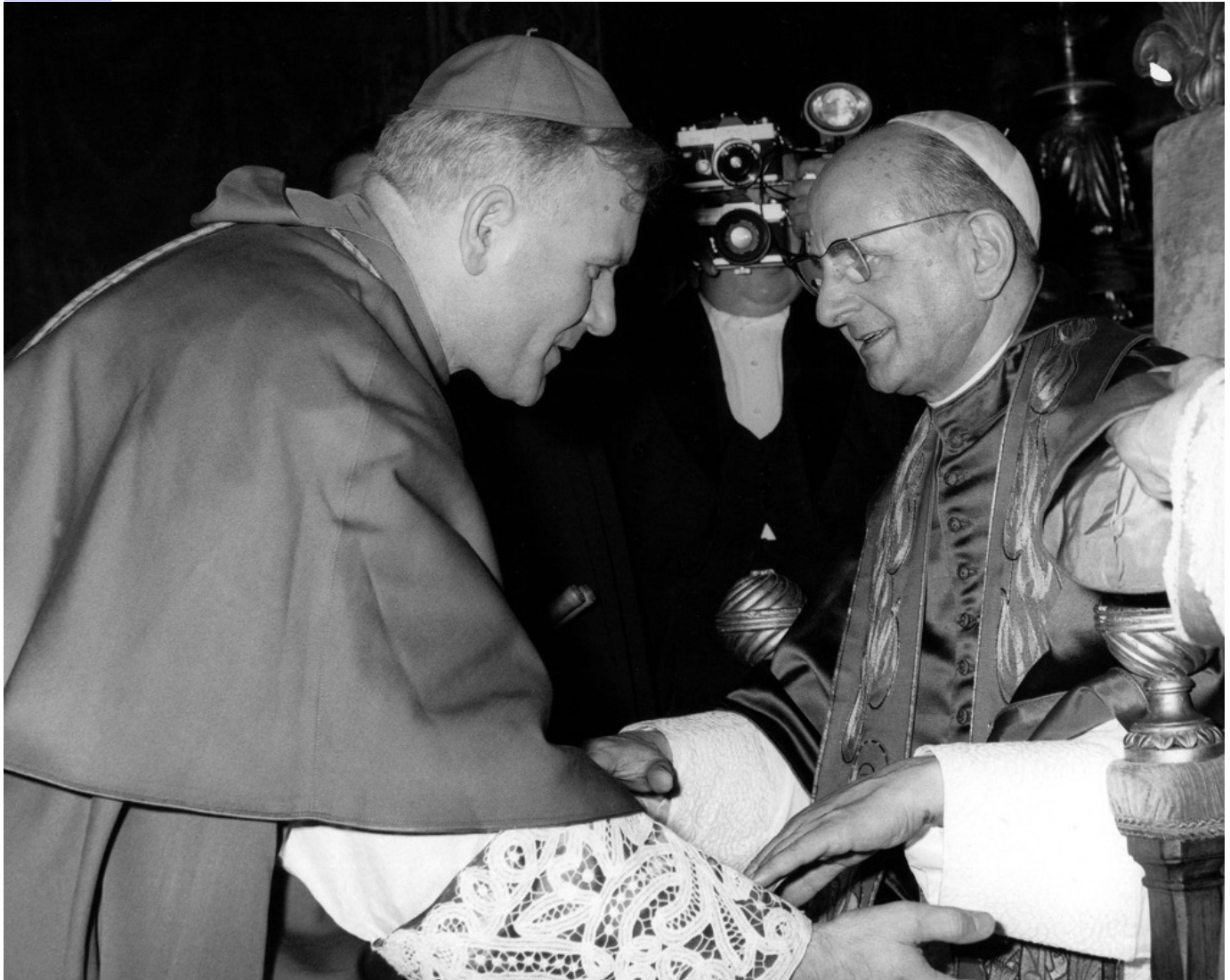
Cardinal Karol Wojtyla, who later became Pope John Paul II, is congratulated by Pope Paul VI at his installation as cardinal in the Sistine Chapel June 26, 1967.