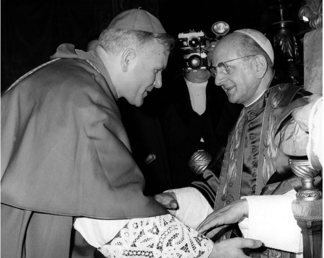
Cardinal Karol Wojtyla, who later became Pope John Paul II, is congratulated by Pope Paul VI at his installation as cardinal in the Sistine Chapel June 26, 1967.