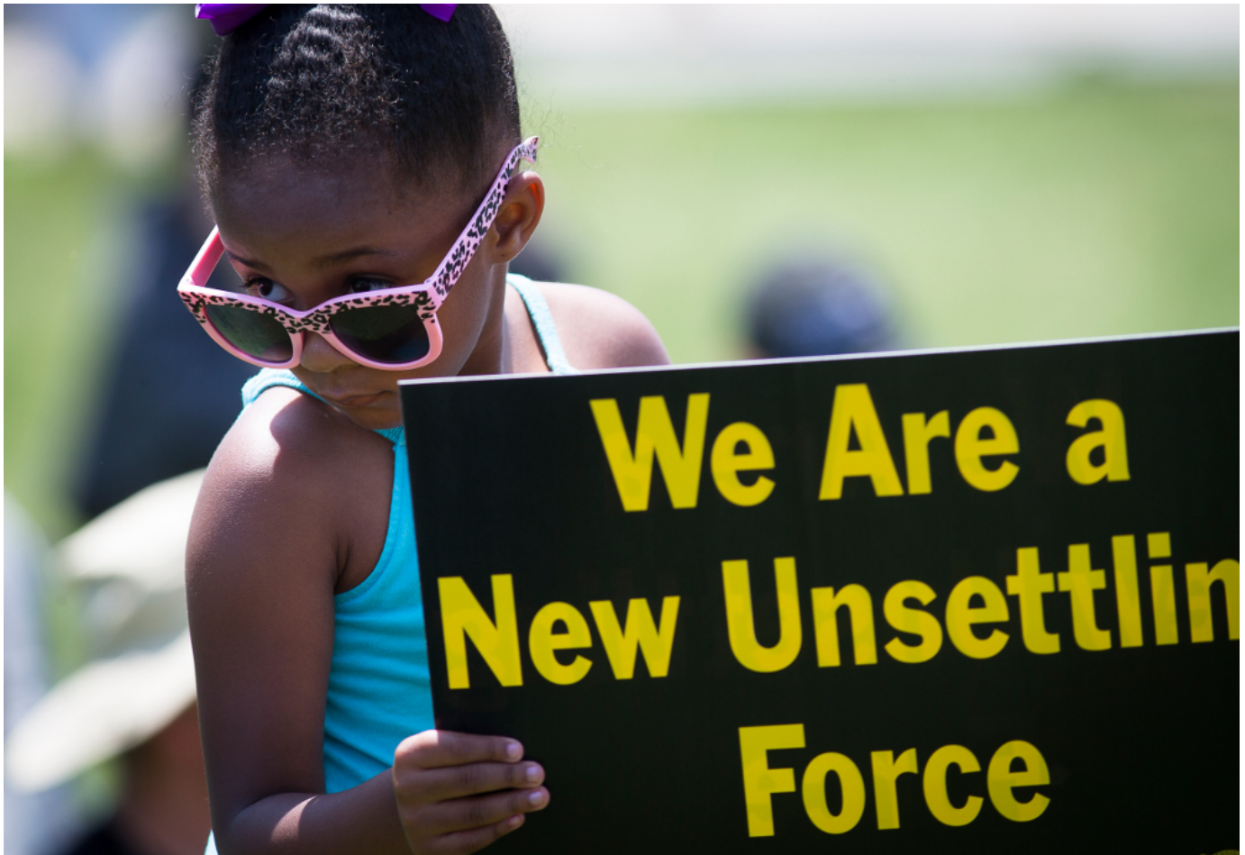
A girl is seen near the Capitol in Washington May 21 during a Poor People's Campaign protest to combat systemic racism.