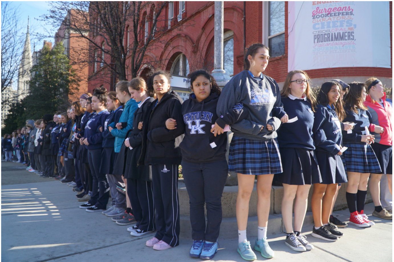
Presentation Academy students stand arm in arm on the sidewalk in downtown Louisville, Kentucky, after walking out of class March 14 to call attention to gun violence.

Catholic social ethics involves not only orthodoxy (right teaching) but also orthopraxis (right practice). The Catholic tradition thus has to be concerned with the concrete ways of overcoming injustice and making justice, peace, and the integrity of creation more prevalent in our local, national, and global realities. Today moral theologians are more conscious of their responsibilities in this area of bringing about social change through more than just teaching what is right or wrong.