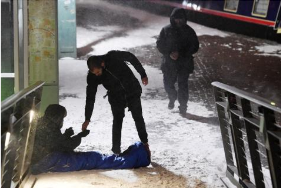
A man gives a homeless person money March 1 in Birmingham, England.

recently involves nongovernment organizations (NGOs). They have already had a significant effect in working for justice, peace, and the integrity of creation throughout the globe.