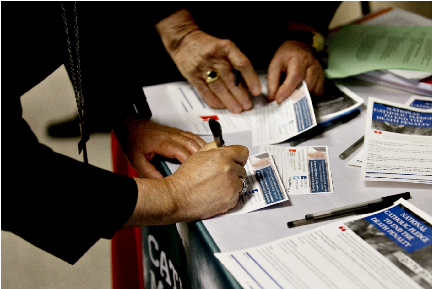
Bishops sign pledges to end the death penalty at the U.S. Conference of Catholic Bishops building in Washington in May 2017.