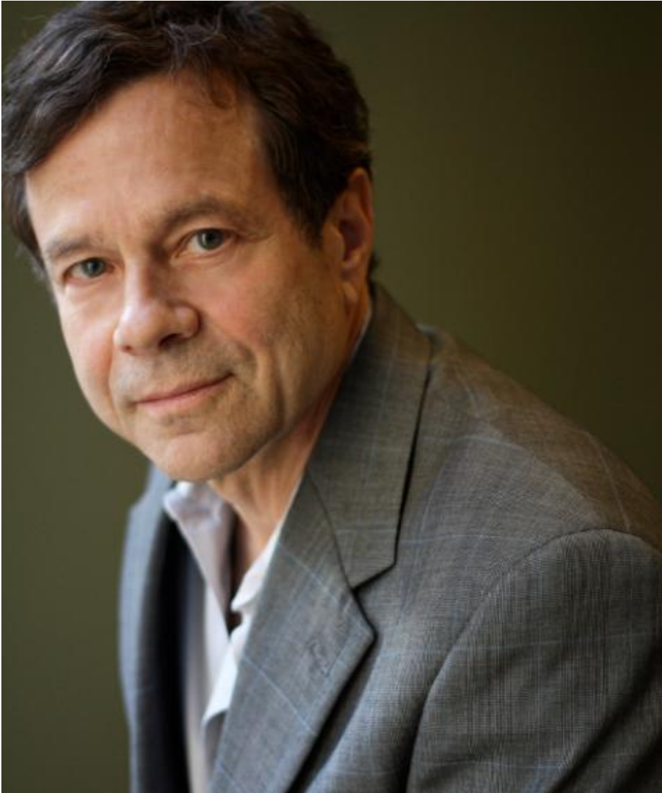
Alan Lightman

As a budding astrophysicist, he worked with Einstein's equations for gravity as well as other equations describing gas flow, radiation processes and thermodynamics. He learned among other things that Cygnus X-1 was located about 7,000 light years from Earth. Later, he applied those equations to other newly discovered black holes.