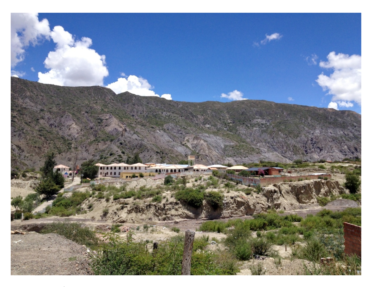
The Fundación Alalay children's home in Huajchilla, near La Paz, Bolivia