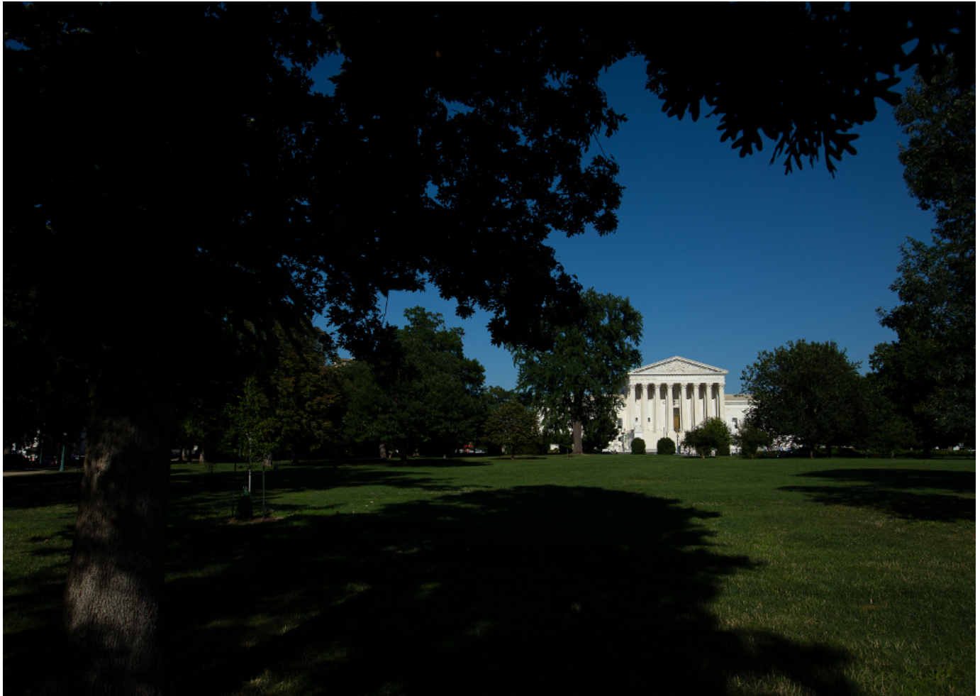
U.S. Supreme Court