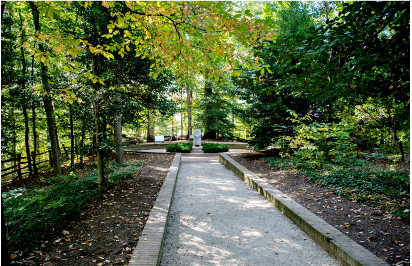
The slave burial ground and Slave Memorial at Mount Vernon, Virginia, the home of George Washington

I had long recognized that to credit any moral superiority to George Washington over his decision to free his slaves upon his death, over against Thomas Jefferson's failure to do so, overlooked a key historical fact: In 1794, Eli Whitney received a patent for his cotton gin. At the end of the 18th century, with the decline of the tobacco industry, slaves were becoming more of a burden than an asset. As the use of the cotton gin became widespread, the value of slaves needed to harvest cotton restored their value. Washington did not realize how valuable his slaves were when he wrote his will. Jefferson did when he wrote his.